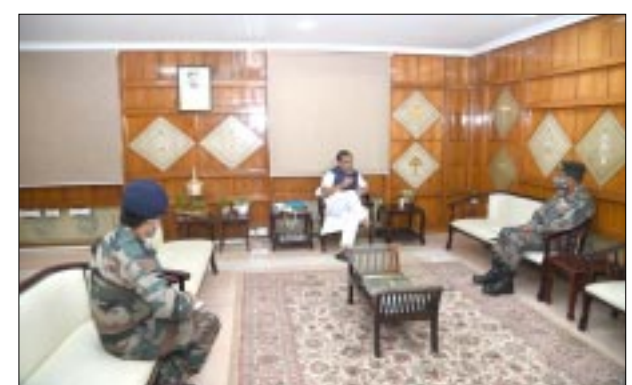
tration to perform its role in community service, public awareness campaigns and nation building.

Guwahati, 17 June : Shri Himanta Biswa Sarma, CM Assam assured Maj Gen Ananta Bhuyan, SM, ADG NCC North Eastern Region of the state his government's full support to NCC in its endeavour to strengthen the unity of the country and spread nationalism among youth of the state. During a meeting on 16 June 2021 with the ADG, the CM was informed about various NCC activities in the state. Gen Bhuyan specifically highlighted expansion of NCC in border areas of Assam and introduction of NCC as an elective subject in the Colleges of Assam as per UGC guidelines. He also assured the CM that NCC cadets are always available to the State adminis-