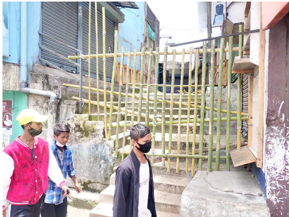
Shillong- Iewduh has erected bamboo fence on Thursday