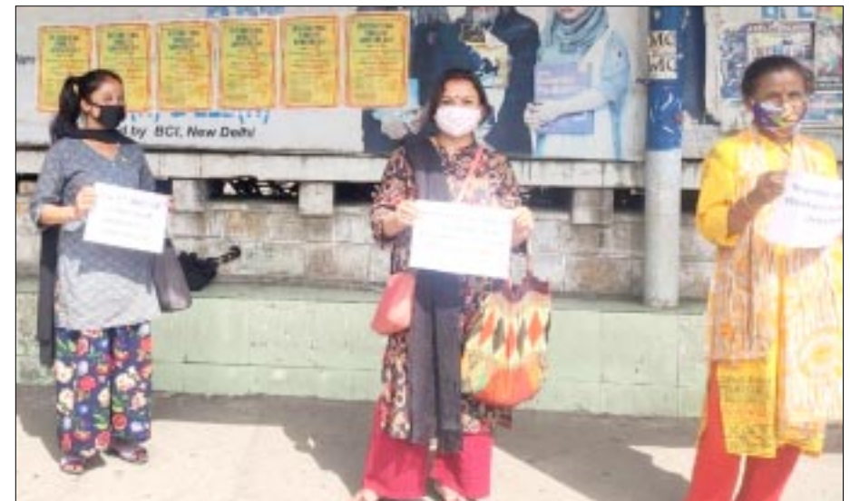
Shillong- Domestic Workers Union Protest on Thursday

with others had visited the historic Nagsankar Temple and distributed food for the rare species of tortoises in the ponds on Thursday. Notably, the two big ponds located inside the premises of the temple