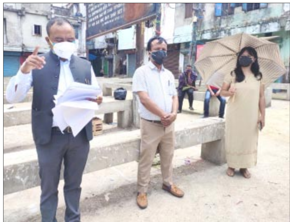
Shillong- Iewduh was closed on Thursday