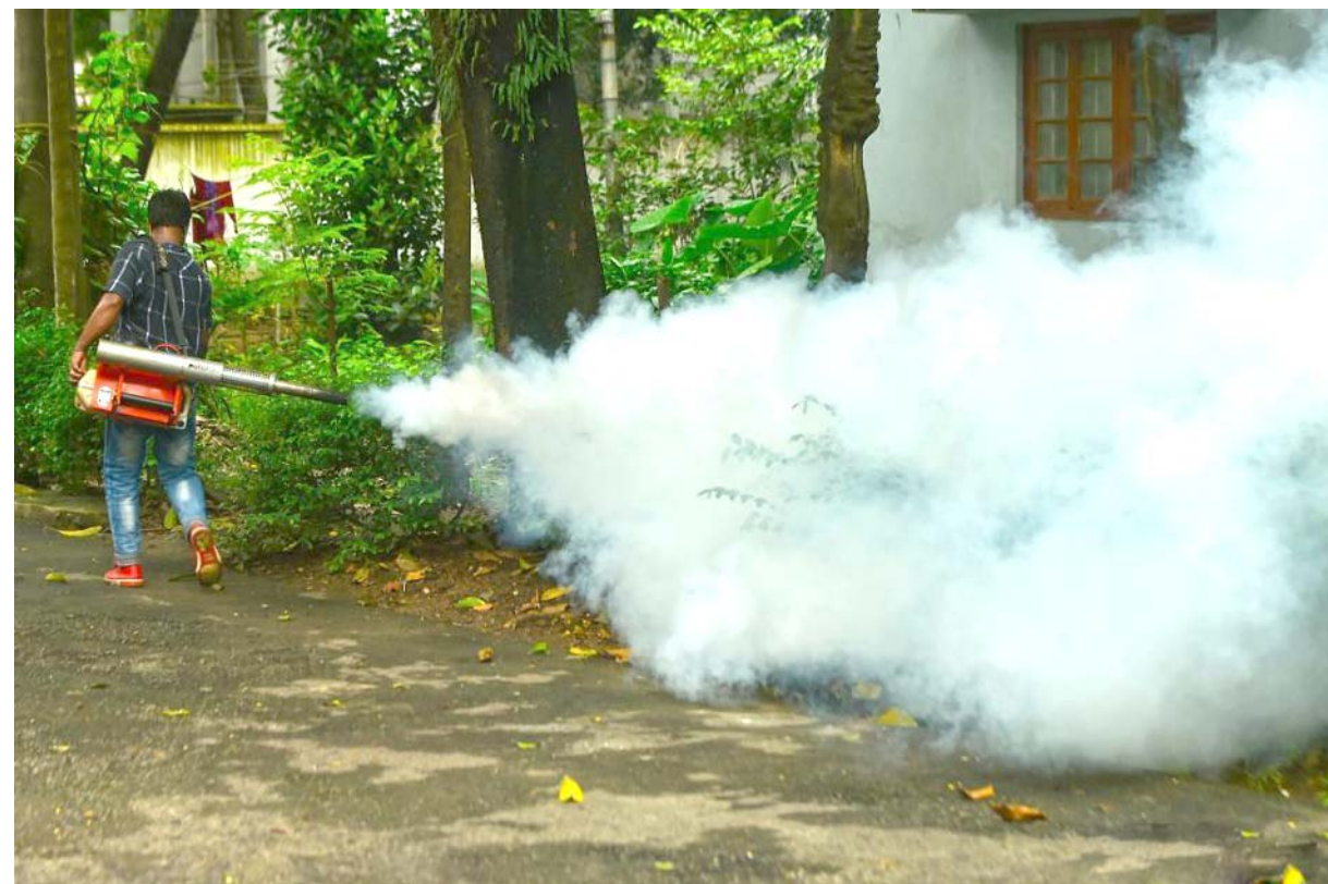
A worker sprays anti-mosquito fog in Dhaka, Bangladesh

estimated 2,760 last year from below 900 two decades ago. A 57-year-old man has been killed by a brown bear in central Slovakia, in what the state forestry company said could be the first confirmed deadly attack by a wild bear, whose population has tripled in 20 years. "An autopsy confirmed today that the man from Liptovska Luzna died from injuries caused by this predator," the forestry company, Lesy Slovenskej republiky, said on Facebook. Bears are common in Slovak mountains, and their numbers have swollen to an estimated 2,760 last year from fewer than 900 two decades ago, said the forestry company, which has argued for legal hunting of bears to manage their population. Slovakia's environment ministry said the bear's DNA samples would be collected to identify the animal. It said that while there had been five bear attacks on people last year, none were fatal. News website SME reported the man went missing after going for a