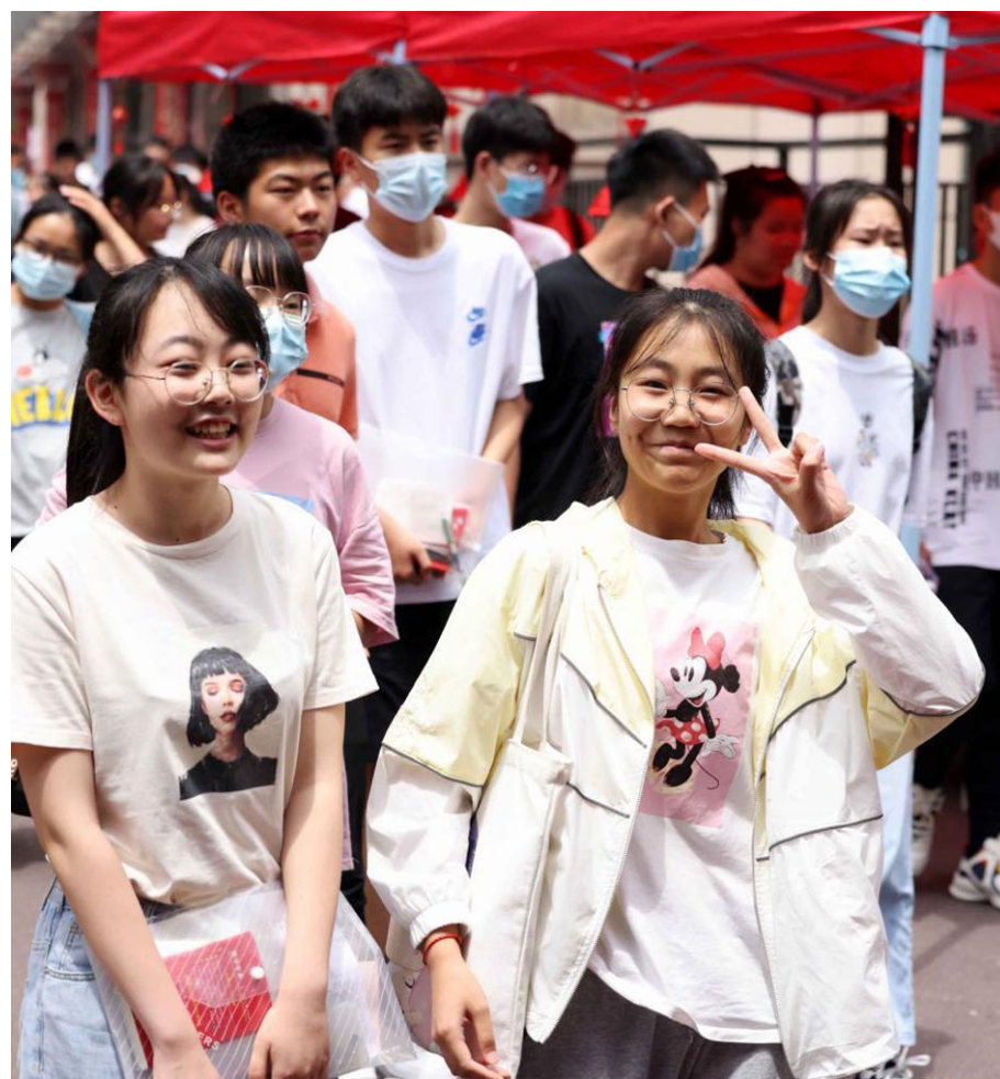
Examinees walk out of an exam site of the 2021 senior high school entrance examination in Hefei, capital of east China's Anhui Province