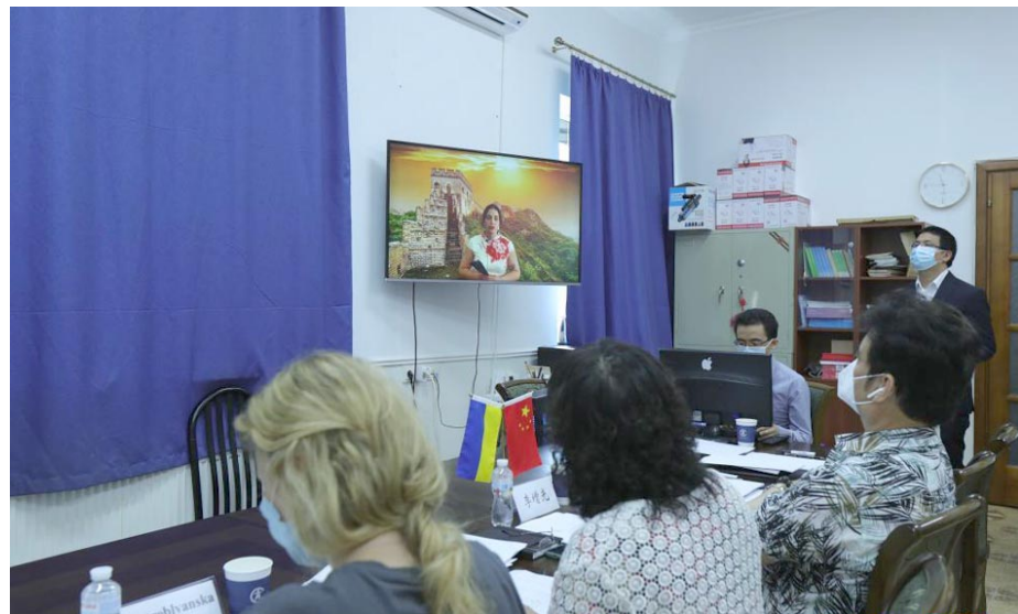
A contestant delivers a speech via video link during a contest of the 20th Chinese Bridge, in Ukraine,

Beijing, June 15 : China's mission to the European Union has urged Nato to stop exaggerating the "China threat theory" after the group's leaders warned that the country presents "systemic challenges". Leaders from the transatlantic security alliance took a forceful stance towards Beijing on Monday in a communique at United States president Joe Biden's first summit with the alliance. "China's stated ambitions and assertive behaviour present systemic challenges to the rules-based international order and to areas relevant to alliance security," Nato leaders said. The new US president has urged his fellow Nato leaders to stand up to China's authoritarianism and growing military might, a change of focus for an alliance created to defend Europe from the Soviet Union during the cold war. But China's European mission hit back on Tuesday, saying in a post on its website that the Nato statement "slandered" China's peaceful development, misjudged the international situation, and indicated a "cold war mentality".