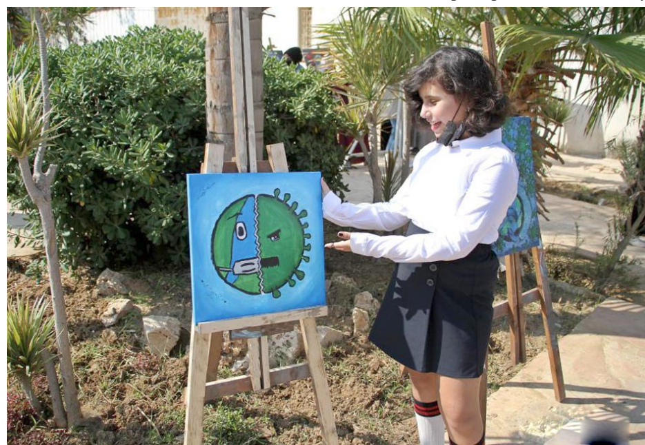
A Palestinian girl views an artwork at a COVID-19 awareness exhibition in Gaza