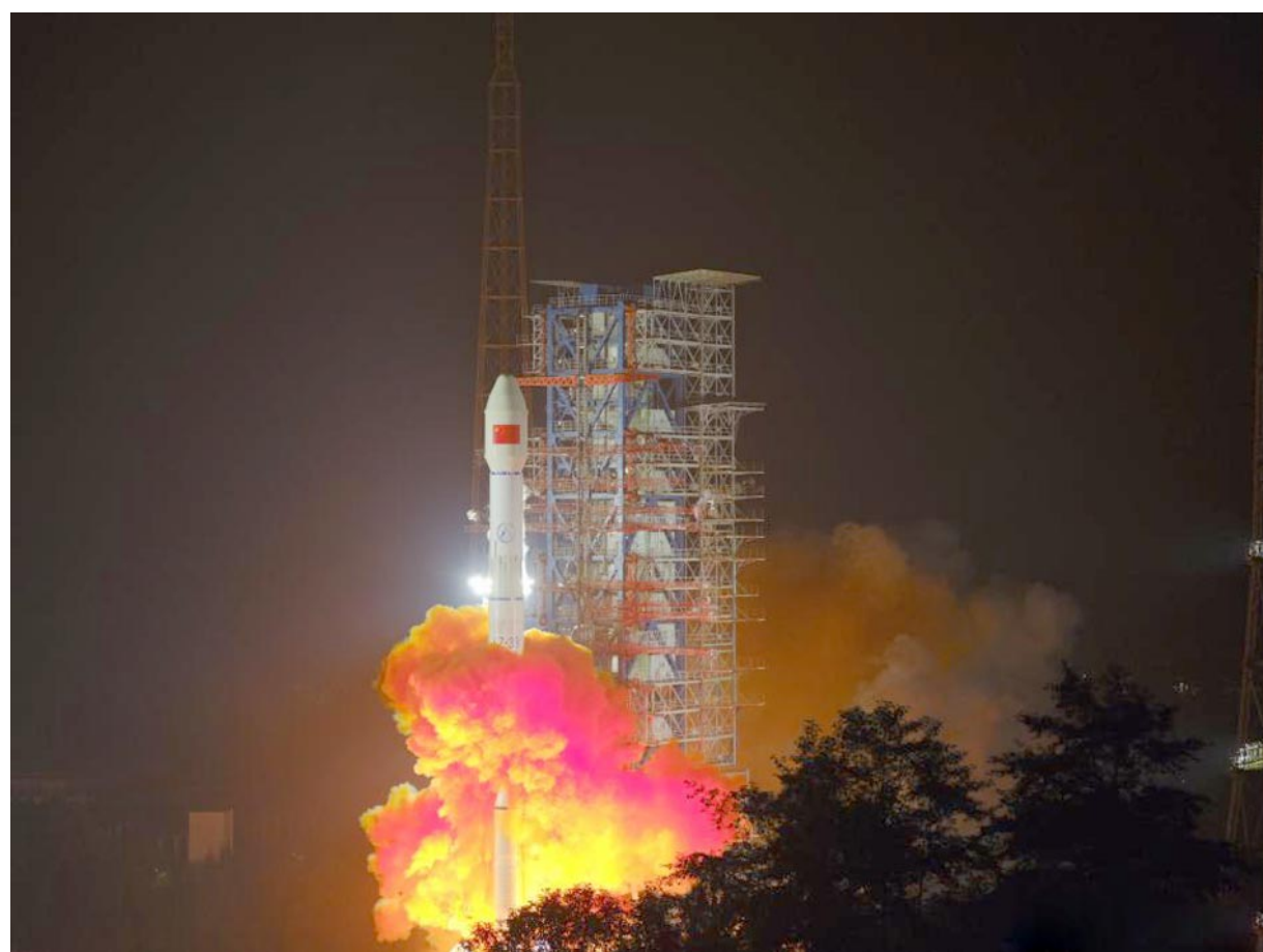
People purchase goods at booths during a shopping festival in Guangzhou, capital of south China's Guangdong Province

Congress has been piggybacking on the NCP in Maharashtra - a state where it once enjoyed significant stronghold in many regions and was in office for 15 years from 1999-2014. "The reason why the Congress could come to power in Maharashtra in 2019 was because of the NCP. But the party