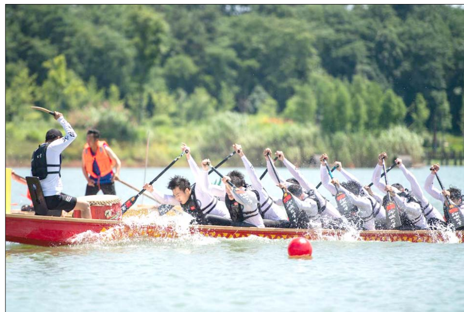
People participate in a dragon boat racing at Qutzi Cultural Park in Miluo City, central China's Hunan Province