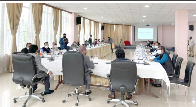
Shillong- meeting to discussed on COVID-19

programme and write a thesis about his art form. Sushant Singh Rajput's death was followed by multiple investigations, which are still going on. He starred in many Bollywood movies, including "MS Dhoni: The Untold Story", based on the life of the cricketer. His last movie was "Dil Bechara", which released last year in July after his death.