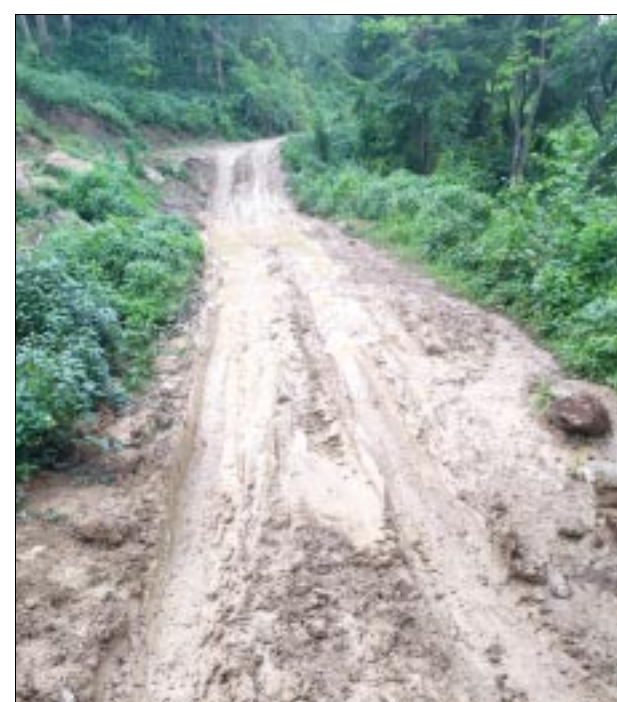
Meghalaya- PWD road bad condition