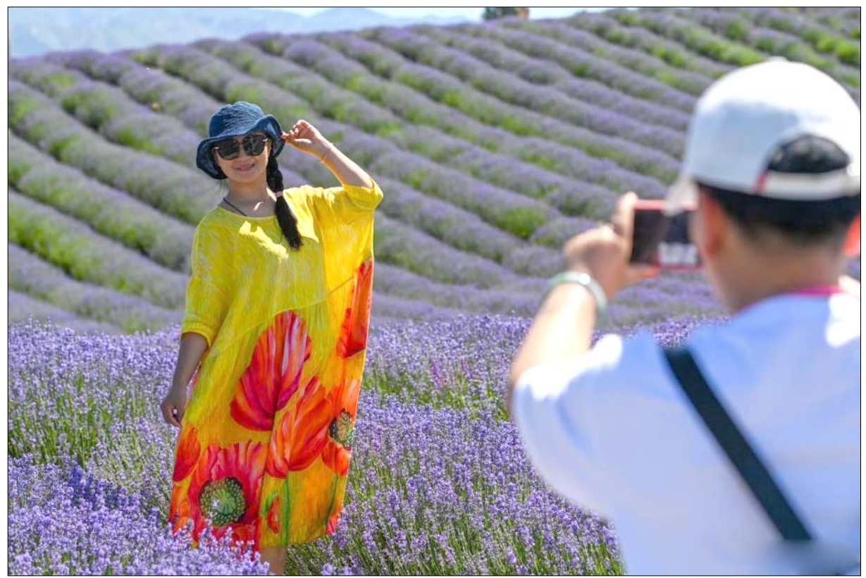
Visitors take photos in a lavender farm in Huocheng County, northwest China's Xinjiang Uygur Autonomous Region