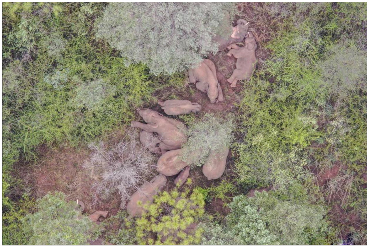
shows a herd of wild Asian elephants in Yimen County of Yuxi City, southwest China's Yunnan Province