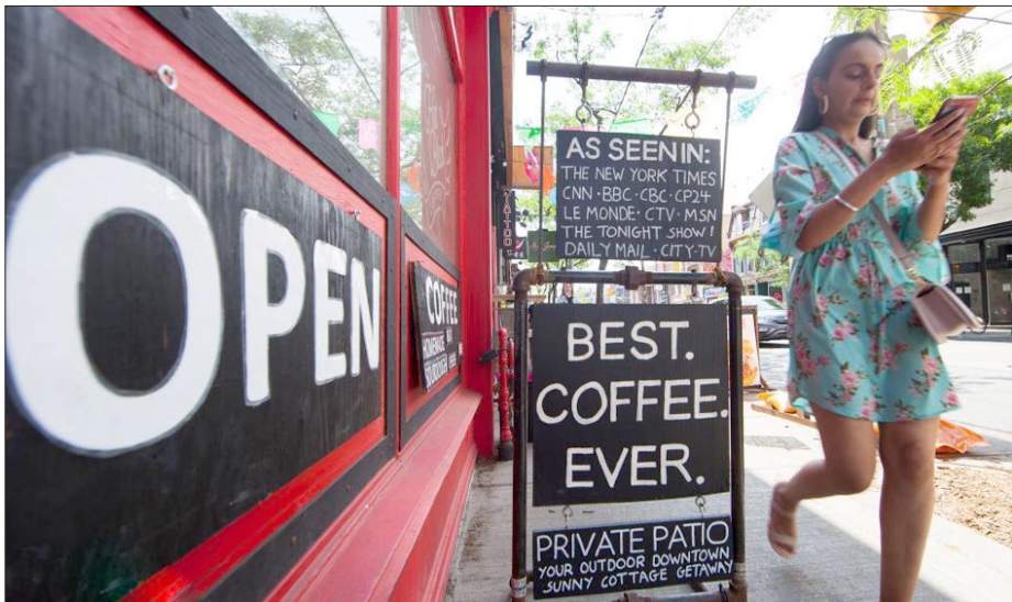
A woman walks past a restaurant with an OPEN sign in Toronto, Ontario, Canada