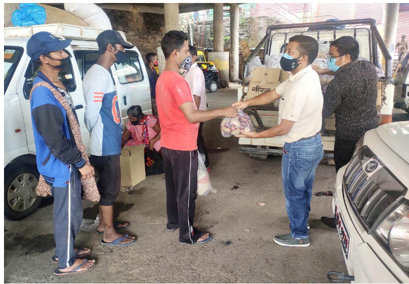
Shillong- distributes food items to vendors

Guwahati, June 12: Transport Minister Chandra Mohan Patowary visited the Azara Railway Yard, Changsari Railway Yard and FCI Godown today to inspect the unloading of goods. Transport Department in collaboration with Railway and FCI officials have been working relentlessly to ensure uninterrupted supply of essential commodities in the state. From May 3 till today, 722 railway rakes have been unloaded engaging 67,347 labourers and dispatched 45,479 trucks to various parts of the state. Transport Minister Patowary has commended the dedicated service of the people engaged in this task and appreciated their endeavor to make essentials goods including medicines available in every nook and corner of the state. Transport Commissioner Adil Khan and other senior officials were present during the visit.