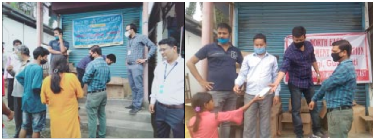
Food item distributed to poor and needy peoples at Guwahati by the members of ngo NEEF and sponsored by Guwahati circle of Canara Bank