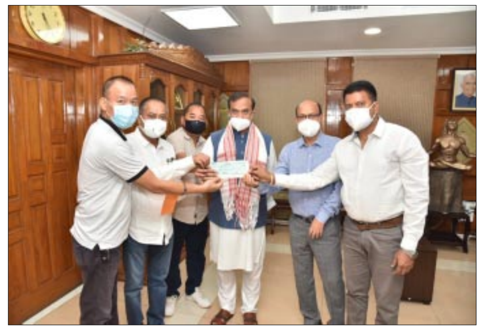
Moinakhurung Stone Crusher Unit Under Kamrup East Division, Guwahati, Donated to Rs 1.80 Lakhs to CM Dr. Himanta Biswa Sarma at His Official Chamber For CM Relief Fund, Recently