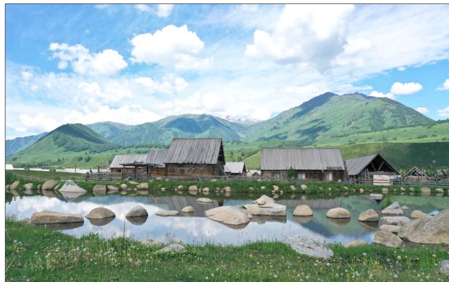
shows scenery in Hemu Village of Kanas, northwest China's Xinjiang Uygur Autonomous Region