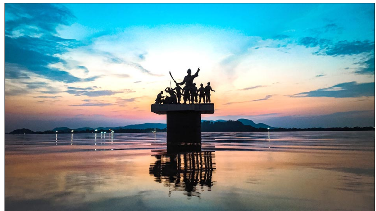
Statue of Mahabir Lachit Barphukana and his soldiers in river Brahmaputra near Fancy Bazar, Guwahati in the time of 'Surya Grahana' at Thursday.