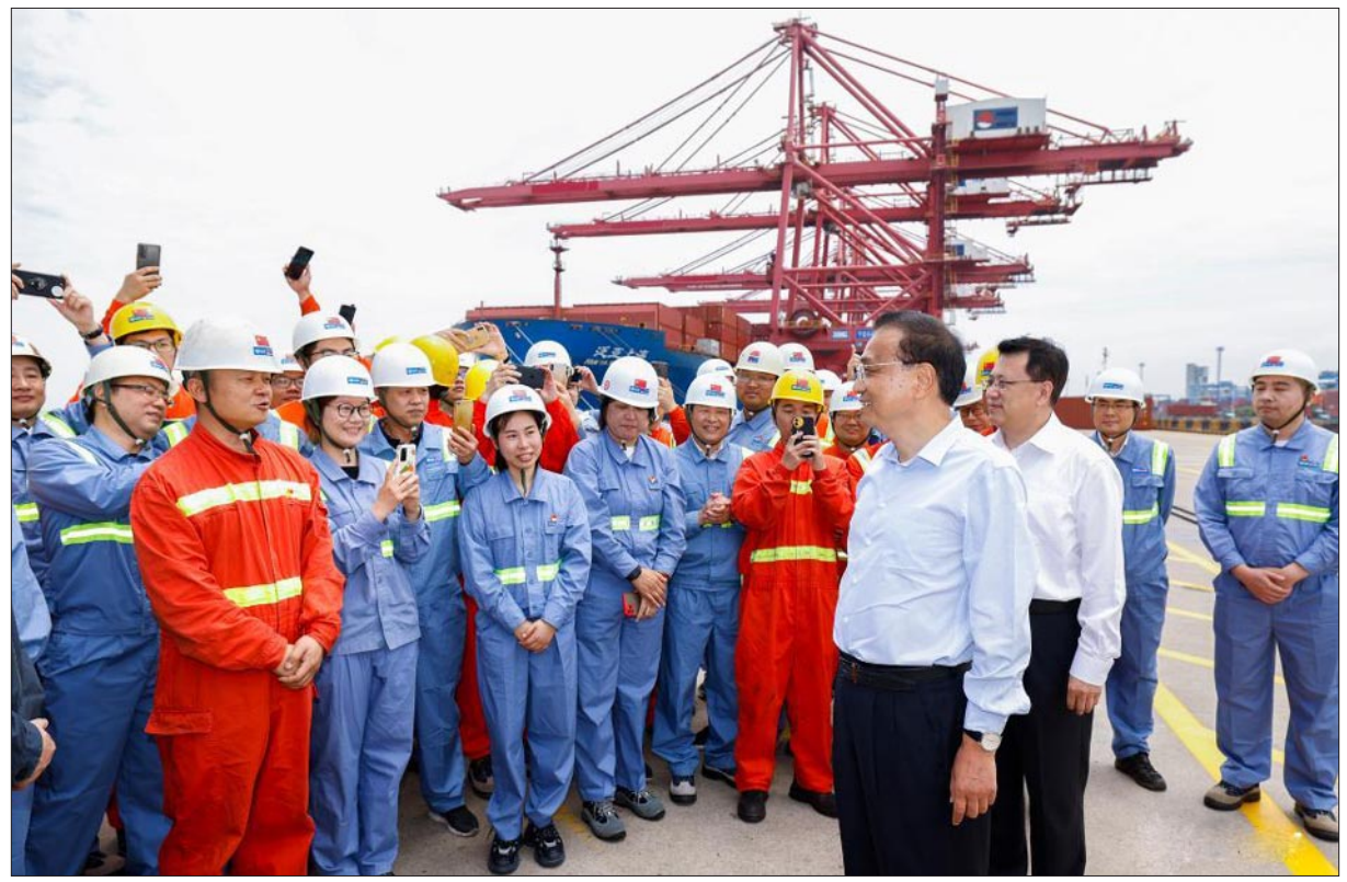
Inspection tour to the city of Ningbo in east China's Zhejiang Province from Monday to Tuesday