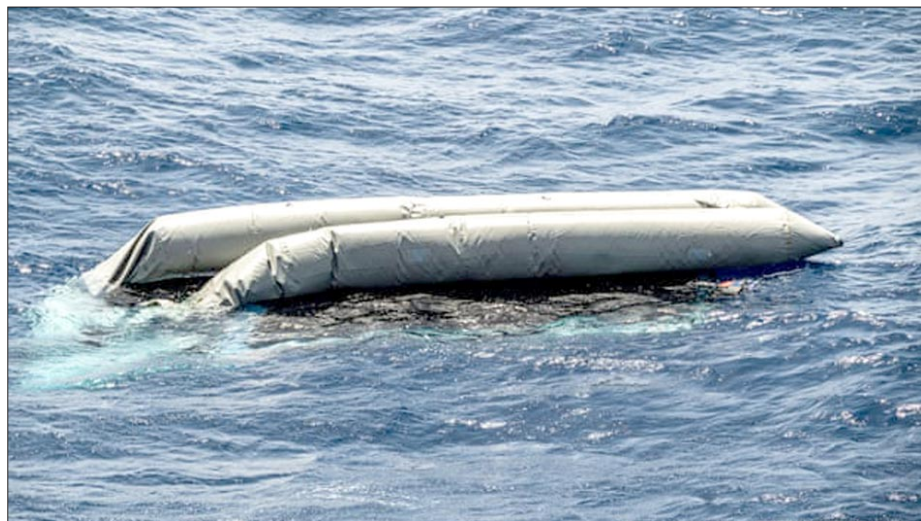
Children's bodies wash up on Libyan beach after migrant boats sink