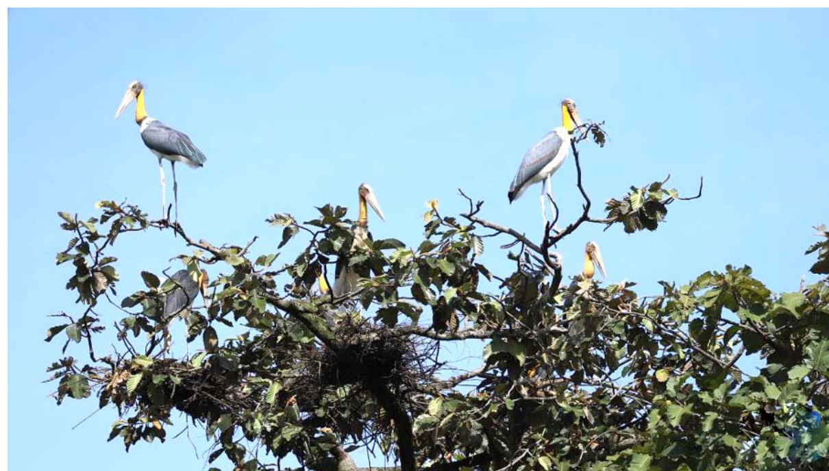
This undated photo shows Lesser Adjutants roosting on tree branches at the Sambo Wildlife Sanctuary in Kratie province, Cambodia