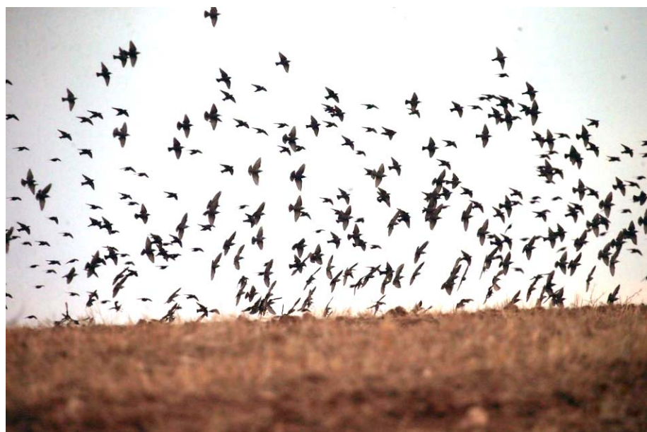
A flock of migrating starlings are pictured in Ankara, Türkiye