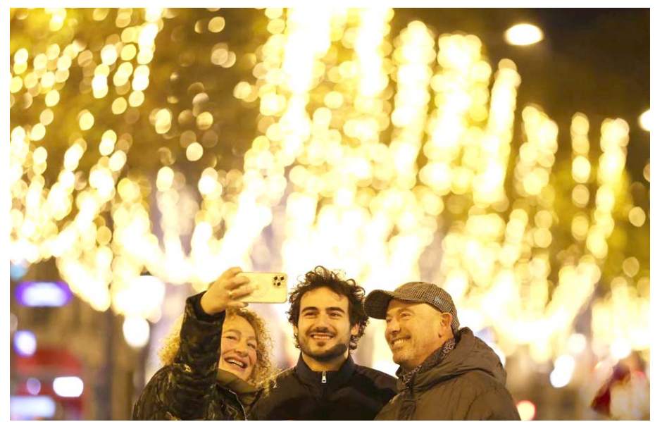
People take photos at the Champs-Élysées lit by Christmas holiday lights in Paris, France

upcoming Mad Max film Furiosa, which wrapped earlier this month. He said he intended to take a break from acting after finishing the publicity tour for Limitless, along with his other contracted work. He will be going home to Byron Bay to spend time with his partner, actor Elsa Pataky, and the couple's three children. "I'm going to have a good chunk of time off and just simplify. Be with the kids, be with my wife."