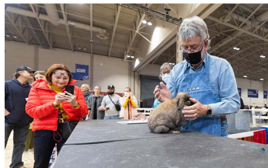
A judge checks a rabbit during the Rabbit & Cavy Show at the 2022 Royal Agricultural Winter Fair in Toronto, Canada