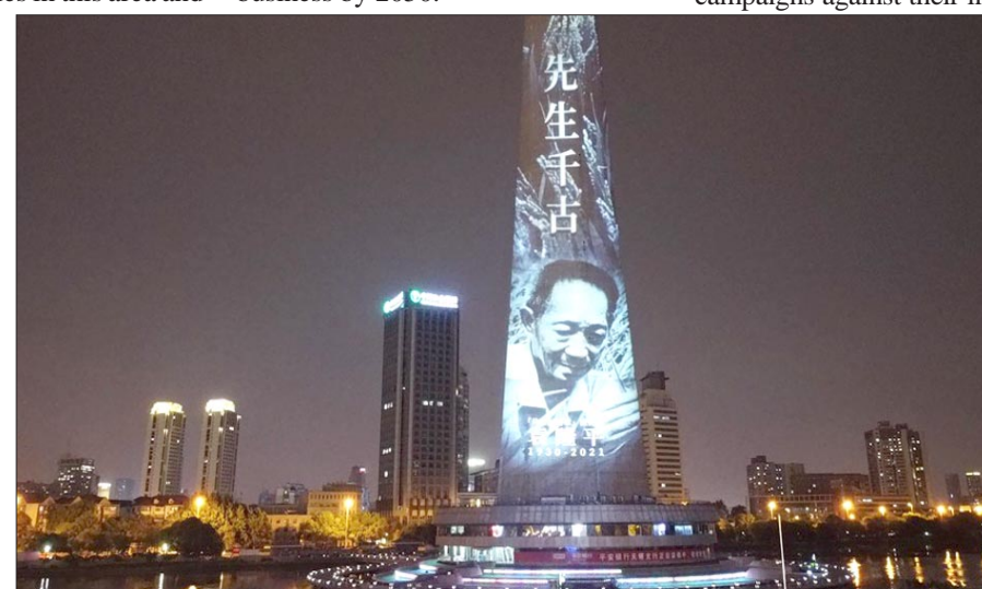
A landmark is lit up in remembrance of Yuan Longping in north China's Tianjin

transition." President Bah Ndaou, the prime minister, Moctar Ouane, and the defence minister, Souleymane Doucoure, were seized on Monday and taken to a military base in Kati outside the capital Bamako, according to diplomatic and government sources. On Twitter, the UN mission in Mali, known as Minusma, said: "We are following events closely and remain committed to supporting the Transition. We call for calm and demand the immediate and unconditional release of the President and prime minister."