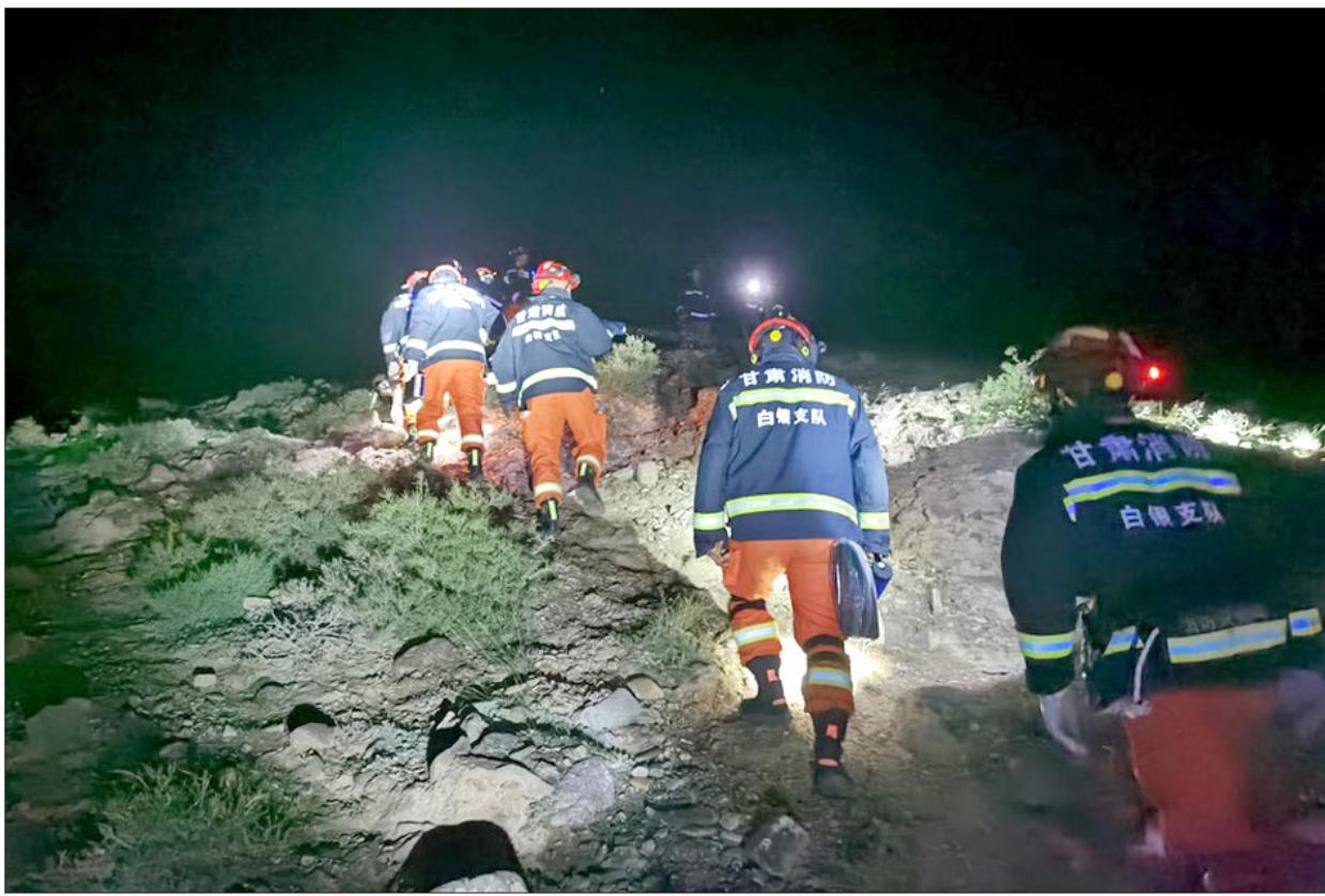
Rescuers search for missing people at the Yellow River Stone Forest tourist site in Jingtai County of Baiyin City