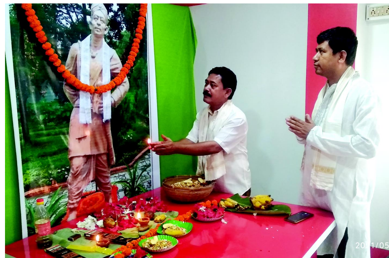
219th death anniversary of Motok King Sarbandan Singha observed by Guwahati Motok Samalnani Committee on Monday

other aspects of the hospital. Talking to the newsmen on the occasion, the Chief Minister said that new ICU beds would greatly boost Contd...Page 6