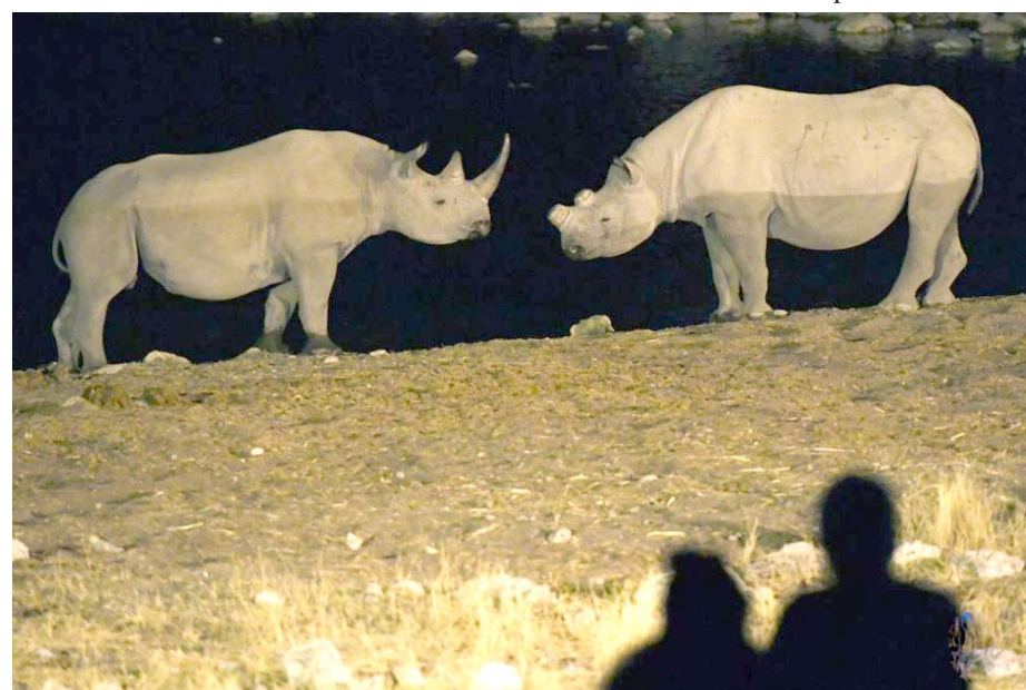
shows rhinos at the Etosha National Park in Namibia

played at a wedding. "Singing such nationalist anthems - especially during the special military operation - will be punished," Aksyonov said in a video on Telegram in September, using Moscow's terminology to describe its