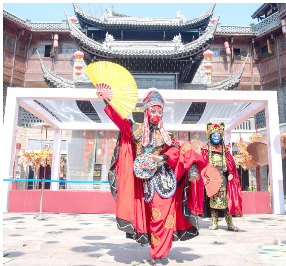
Artists perform Chuanju (Sichuan opera) in Ciqikou ancient town, southwest China's Chongqing Municipality

"irreversible" nuclear power. US president Joe Biden and Japanese prime minister Fumio Kishida condemned North Korea's latest launch "in the strongest terms". South Korean president Yoon Suk-yeol called the launch a "provocation", and vowed a "stern response". The Tuesday test was Pyongyang's fifth missile launch in 10 days. North Korea does not routinely comment on its weapons tests in state media. South Korean and US officials have been warning for months that Kim is preparing to conduct another nuclear test, saying last week that this could happen soon after Pyongyang's key ally China holds a Communist party congress from 16 October. US vice-president Kamala Harris visited Seoul last week and toured the heavily fortified demilitarised zone that divides the Korean peninsula, on a trip to underscore her country's commitment to South Korea's defence. About 28,500 US troops are stationed in South Korea to help protect it from the North.