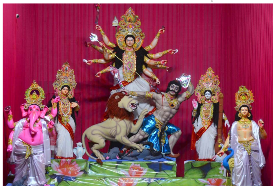
Guwahati- Shantibari durga puja lighting On Sunday