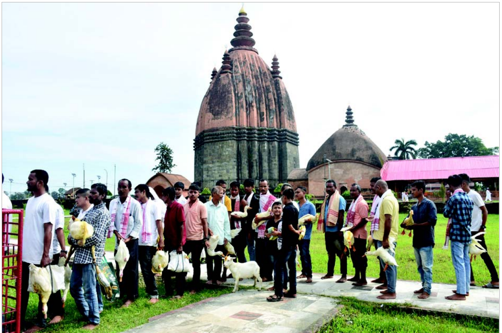
Sivasagar- Devotees give sacrifice at the Devi Dol on Sunday