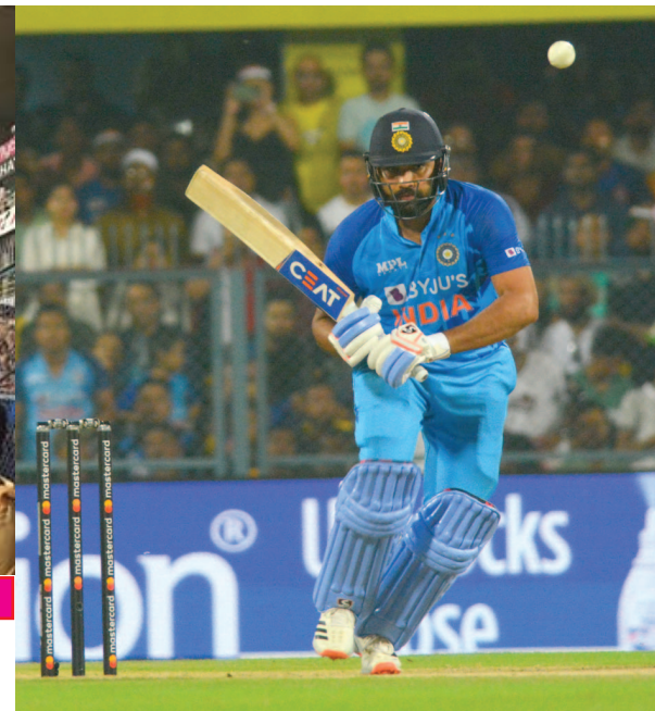
Guwahati- Second T20 match between India and South Africa On Sunday