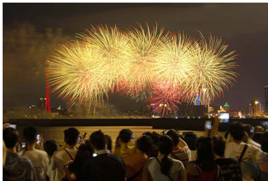
A villager picks winter jujubes at a greenhouse in Xiaopo Village of Dali County

consumption is small, but Hubert expects demand to rocket in the next 10 years. Scientists agree that insects are the ecological and economic future of food production. A 2013 United Nations report concluded that edible insects are a "promising alternative to the conventional production of meat". It added: "The case needs to be made to consumers that eating insects is not only good for their health, it is good for the planet."