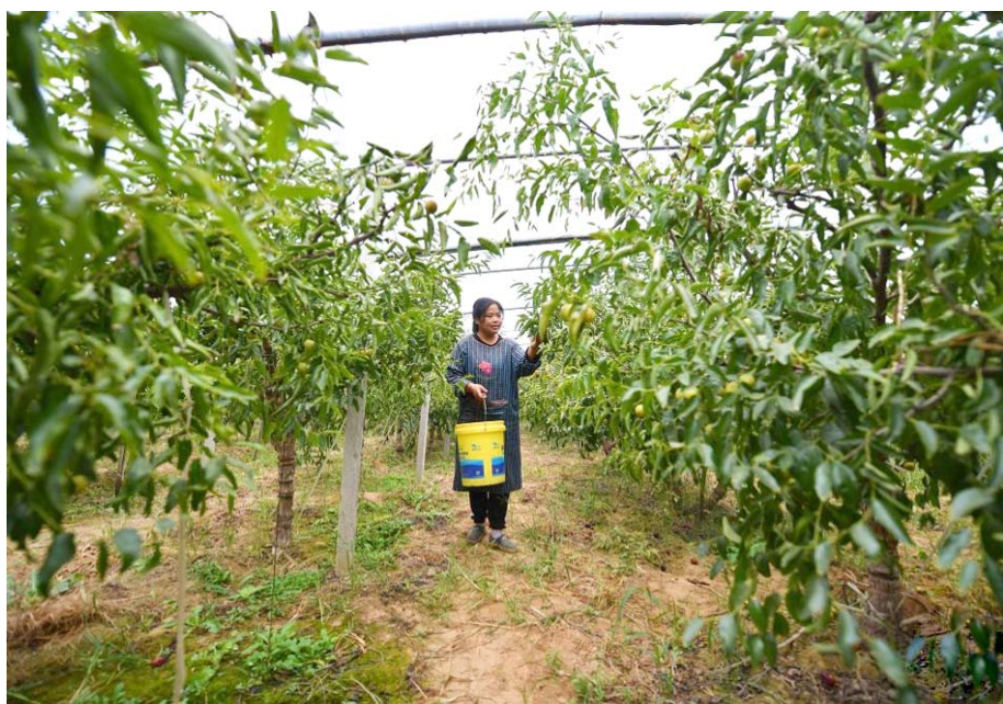
A villager picks winter jujubes at a greenhouse in Xiaopo Village of Dali County