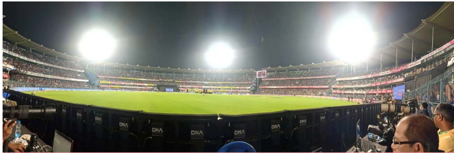
Guwahati- Aerial view Barsapara Cricket Stadium On Sunday

A Jammu and Kashmir Police personnel was killed and a Central Reserve Police Force (CRPF) jawan was injured in a terrorist attack on a joint party of CRPF and police in Pulwama district of Jammu and Kashmir on Sunday, police said. The terrorists attacked the joint Naka party of CRPF and police in the Pinglana area of the south Kashmir district. Security officials have cordoned off the area. "Terrorists fired upon joint naka party of CRPF and Police at Pinglana, Pulwama.