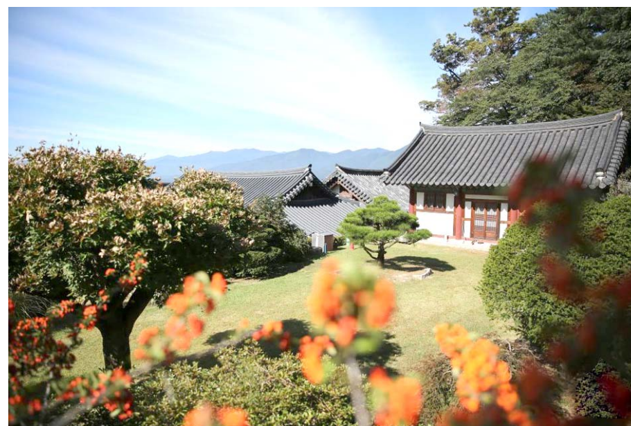
shows a view in the Buseoksa Temple in Yeongju, South Korea. Buseoksa Temple is one of the seven Buddhist mountain monasteries in South Korea

and officials warned that they had "literally nothing to come back to". With massive devastation and flooding from Fort Myers on the Gulf of Mexico, through central areas including Orlando, to Cape Canaveral on the Atlantic coast, officials warned the recovery from what Joe Biden said on Thursday "could be the deadliest hurricane in Florida's history" would be lengthy.