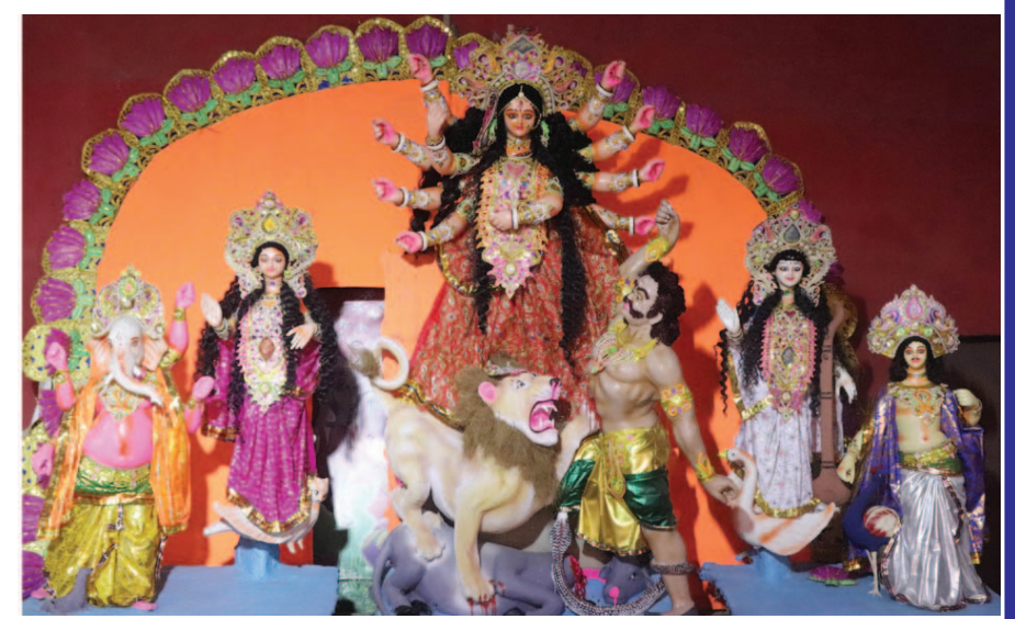
Guwahati- Durga Puja Pandal on Saturday