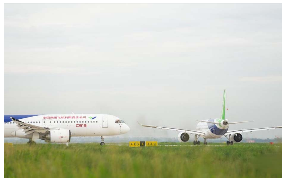
shows C919 jets in Pucheng County, northwest China's Shaanxi Province

pointed at Russia. Moscow has repeatedly underlined its capability to disrupt Europe's energy infrastructure. On Friday, Vladimir Putin blamed the US and its allies for blowing up the pipelines, raising the temperature in the crisis. Offering no evidence for his claim, the Russian president said in a speech to mark the annexation of four Ukrainian regions: "The sanctions were not enough for the Anglo-Saxons: they moved on to sabotage. It is hard to believe but it is a fact that they organised the blasts on the Nord Stream international gas pipelines." The methane clouds are being monitored closely. The ICOS, which is analysing the air quality, has shown footage of a huge gas cloud hovering above the Baltic Sea and moving across Europe.