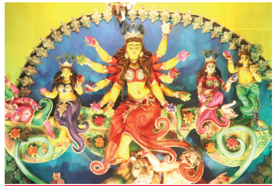
Guwahati- Durga Puja at Bina Pani area at Athgaon On Saturday

tricts of Arunachal Pradesh, including Tirap, Changlang and Longleng districts, from Saturday, October 1 to March 30 next year. The government has also extended AFSPA in the areas falling within the jurisdiction of Namsai and Mahadevpur police stations in Arunachal Pradesh. Furthermore, AFSPA has also been extended in nine districts of