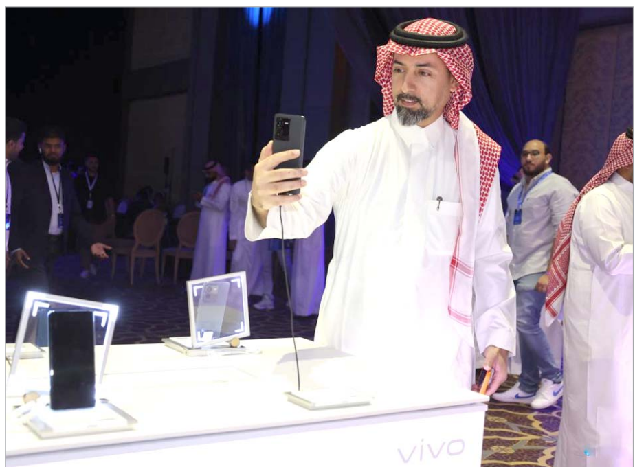
A visitor tries a new smartphone during a launch of Vivo's new products in Riyadh