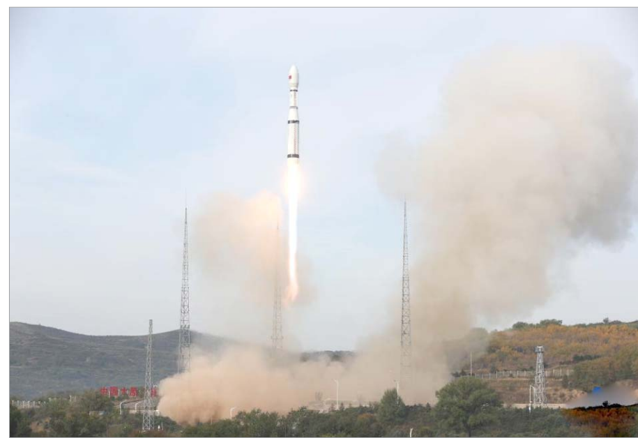
A Long March-6 rocket carrying three satellites blasts off from the Taiyuan Satellite Launch Center in north China's Shanxi Province

coordinate disaster relief and provide assistance. On Monday afternoon, BP and Chevron paused production at offshore oil platforms in the gulf. Nasa plans to move its Artemis 1 lunar rocket off the launch pad at Cape Canaveral, almost 130 miles across from Tampa, on Florida's Atlantic coast, possibly adding weeks' more delay to the mission to fly a crew-capable, though unmanned, exploration capsule around the moon.