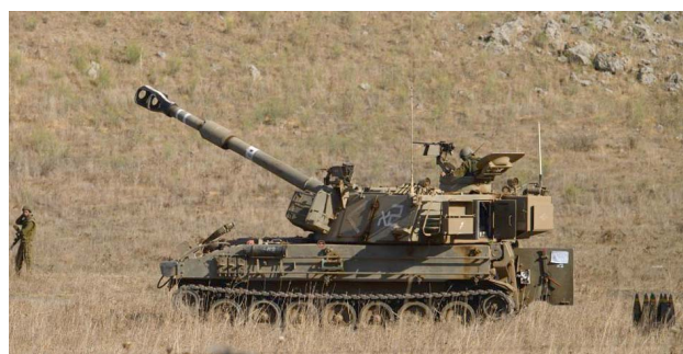
Israeli soldiers take part in a military exercise near the town of Katzin in the Israeli-occupied Golan Heights