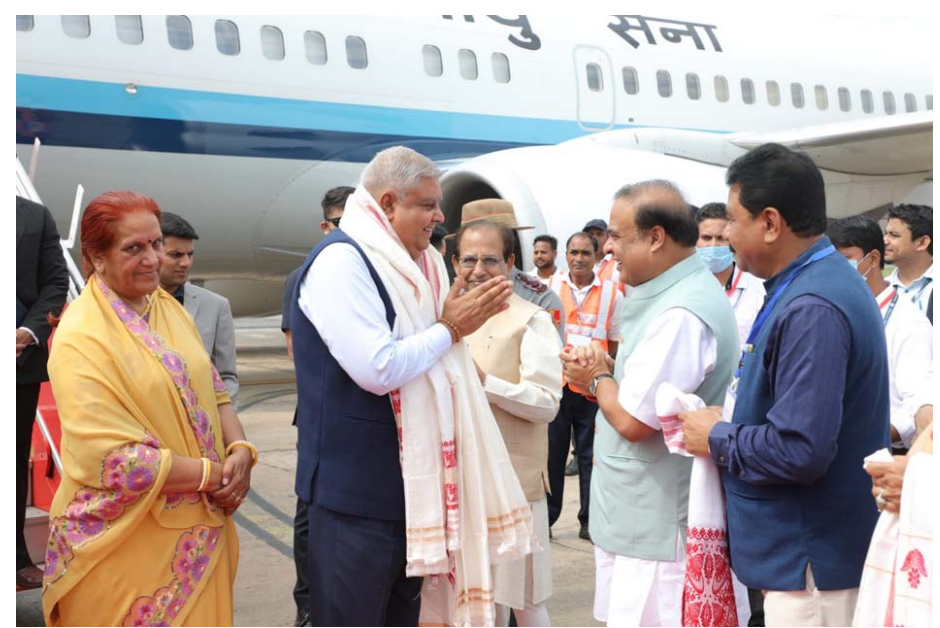
CM Dr. Himanta Biswa Sarma is receiving VP Jagdeep Dhankhar upon his arrival at LGBI Airport on September 22.

Narangi Military Station, Guwahati. The VP was warmly received at the Military Station & accorded a Guard of Honour", Sarma added in another tweet. Meanwhile, Dhankhar will spend the afternoon at the Raj Bhavan. Therefore, he is also slated to visit the Kamakhya Temple, atop the Nilachal Hills, before leaving for New Delhi, the officials added.