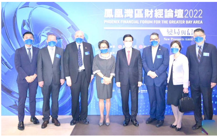
Chief Executive of the Hong Kong Special Administrative Region (HKSAR) John Lee (4th R) poses for a group photo with guests attending a financial forum held by Phoenix TV and other institutions in Hong Kong, south China