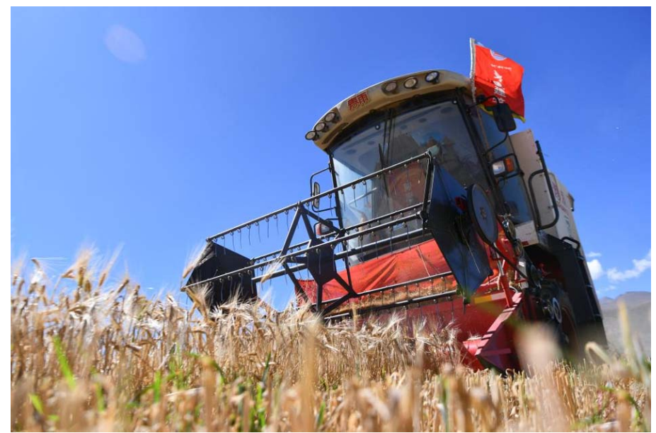
A harvester operates in the highland barley field in Rasog Township of Gyangze County, Xigaze, southwest China's Tibet

had gone to check the village after receiving information that the members of the People's Defence Force were hiding there. According to the Thailand-based Assistance Association for Political Prisoners, which monitors human rights in Myanmar, at least 2,298 civilians have been killed by the security forces since the army seized power last year.