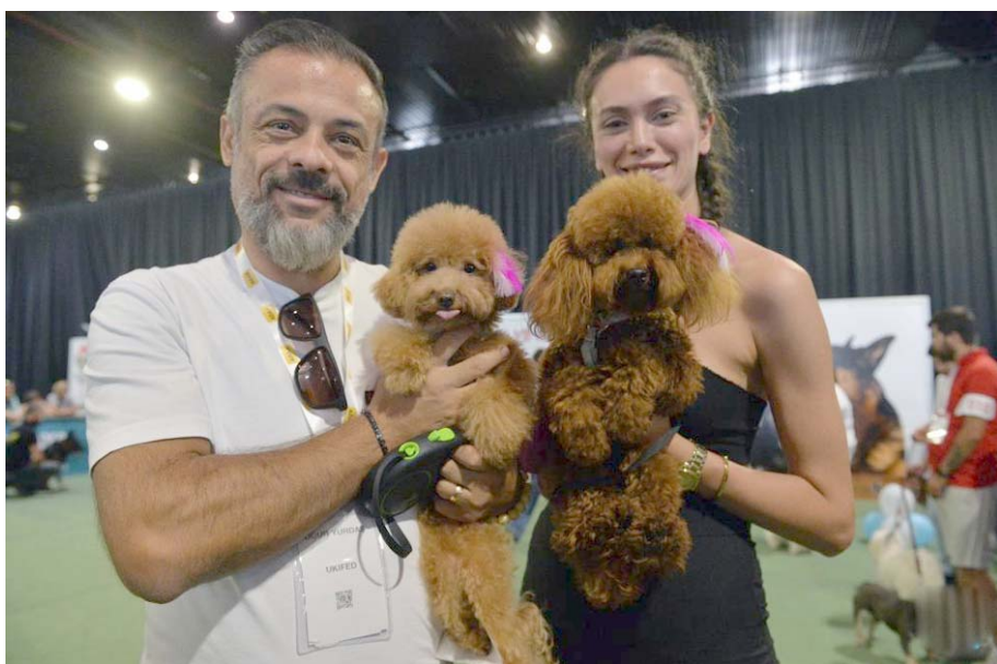
People show pet dogs at PETZOO, a weekend event hosted in Ankara, Türkiye, as the country's biggest pet fair

London, September 20 : Brad Pitt has unveiled his sculptures in a lakeside art museum in Finland as part of the actor's first-ever public art exhibition that came as an unexpected surprise to the Nordic country. Located in Finland's third-largest city of Tampere, this is the first time the "largely self-taught" US star presented his sculptures to the public, the Sara Hildén Art Museum said. Pitt's sculptures were revealed by the 58-year-old actor himself on Saturday as part of a larger exhibition by British artist Thomas Houseago, alongside a ceramic series by Australian musician Nick Cave. "For Nick and I this is a new world and our first entry. It just feels right," Pitt told Finnish broadcaster Yle at the opening ceremony. Pitt's nine works in the show includes a moulded plaster panel "depicting a gunfight" and a series of house-shaped silicone sculptures that each have been shot with a different gauge of ammunition. "To me it's about self-reflection."