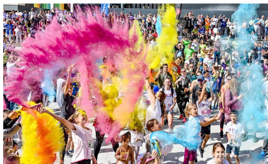
People throw color and dance after they finished the color run in Skopje, North Macedonia

questioned why foreigners in China, many of whom are long-term residents and have not left recently due to Covid-19 barriers, were considered more dangerous than locals.