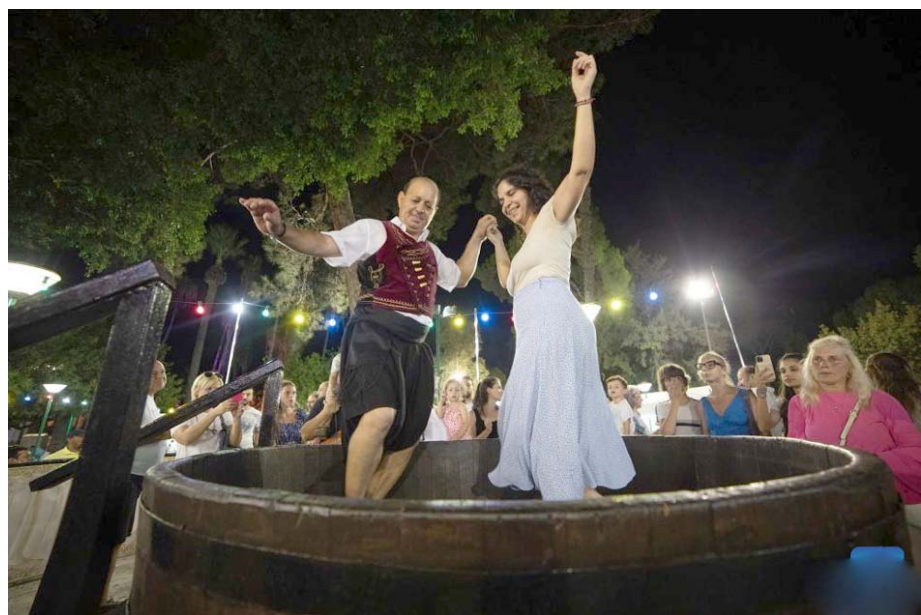
People participate in the grape stomping during the Limassol Wine Festival in Limassol, Cyprus