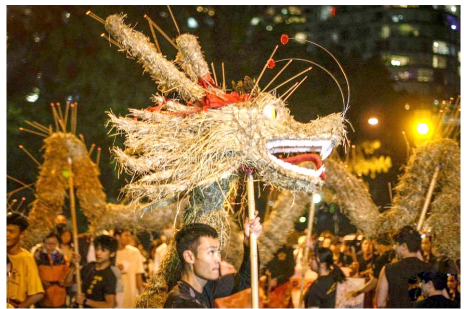
Dragon dancers perform during the Fire Dragon Festival at Chinatown in Vancouver, Canada

(DMs) in Uttar Pradesh have been issued instructions regarding the survey. The government has also ordered holding a survey of unrecognized madrassas by October 5. The teams will constitute officials of the Sub Divisional Magistrate (SDM), Basic Shiksha Adhikari (BSA) and District Minority Officers. Once the survey is conducted it has also been instructed to hand over the report to the Additional District Magistrate (ADM) after which ADM will present the consolidated statements to the District Magistrates (DMs). Moreover, it has been ordered that in case of a disputed management committee or in case of the death of any employee in an aided Madrassas, a post-facto approval for appointment by the principal Madrassas and District Minority Welfare Officer in the dependent quota of the deceased and the existence of a valid management committee has to be sought.