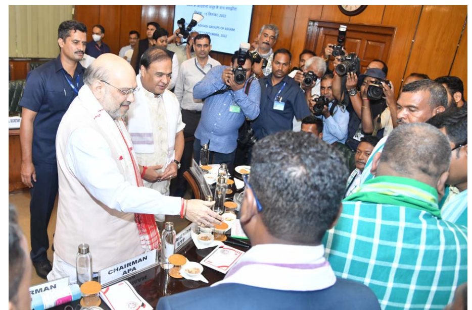
Union Home Minister Amit Shah and Chief Minister Dr Himanta Biswa Sarma during signing of tripartite peace agreement with Adivasi militant groups in New Delhi on Thursday