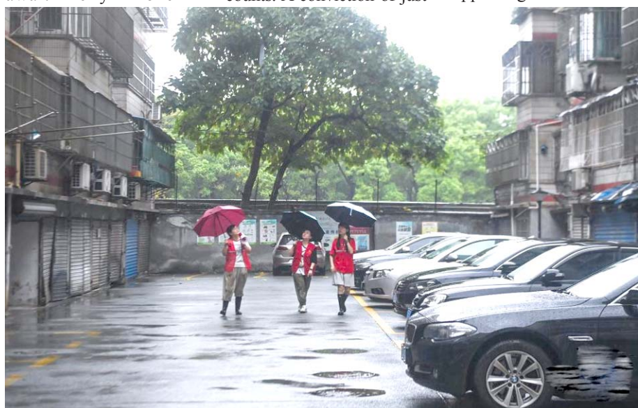
Volunteers patrol at an old residential area in Nanhu District of Jiaxing City, east China's Zhejiang Province

initially teleoperated by four female amateur actors. The dialogue data was annotated for solo laughs, social laughs (where humour isn't involved, such as in polite or embarrassed laughter) and laughter of mirth. This data was then used to train a machine learning system to decide whether to laugh, and to choose the appropriate type. It might feel socially awkward to mimic a small chuckle, but empathetic to join in with a hearty laugh.