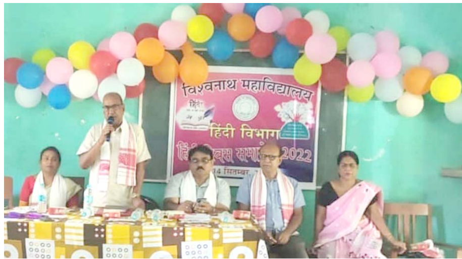
Assam Rising Biswanath Chariati, September 15: Biswanath College, a leading higher

educational institution of the North bank of Assam, celebrates Hindi Diwas with a wide range of programmes on