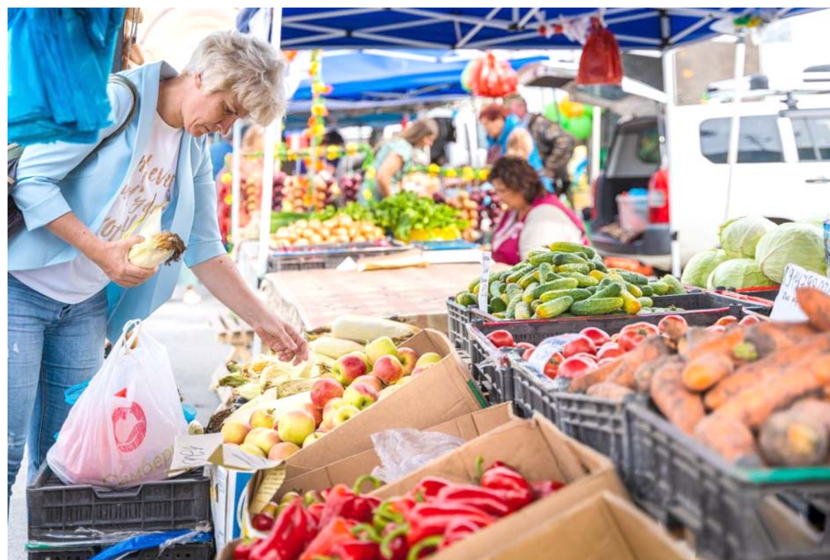
A woman buys vegetables at a food fair in Vladivostok, Russia

region. In Belgorod, a Russian region that borders Kharkiv, the governor's office has said nearly 1,400 people are housed at a temporary camp after crossing the border from Ukraine. Many are families with children who have fled fighting. Hundreds more people are likely staying in rented apartments or with relatives. At a small aid distribution centre in the city, a half-dozen Ukrainians who had recently fled to Russia said they were dumbfounded by Moscow's inability to hold on to the Kharkiv region and withstand the successful Ukrainian counteroffensive that has retaken 8,000 sq km (3,100 sq miles) of territory in just several weeks.