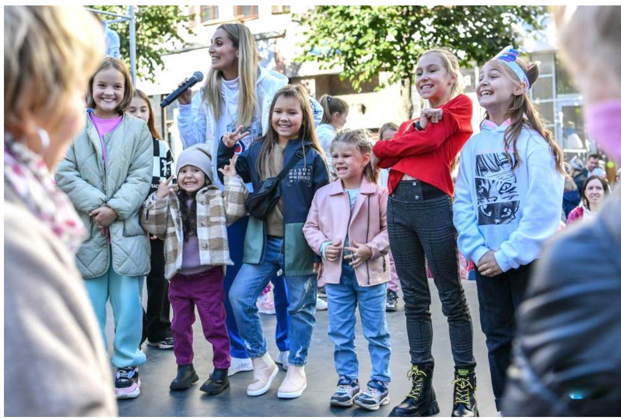
People take part in Moscow City Day celebrations in Moscow, Russia