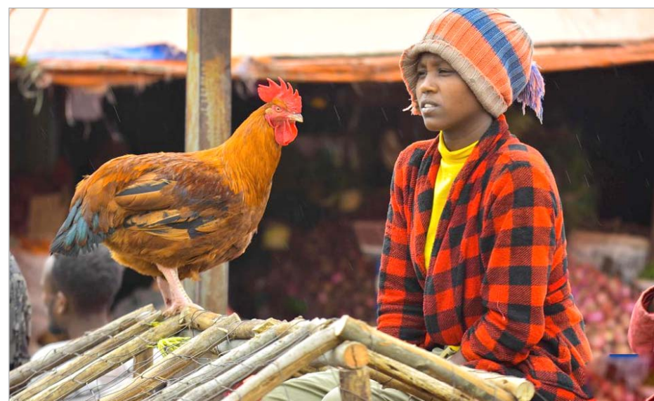
A trader of live chickens is seen at Shola market in Addis Ababa, Ethiopia

product]," he said. "When pork prices are high, the government will stabilise the price of pigs by releasing reserves." China's economy has been battered by an ongoing government "dynamic zero" Covid policy, in which sudden and random lockdowns or movement restrictions have been imposed across the country. Last month's slower growth in consumer prices was attributed in part to the lockdowns, and came as food prices rose 6.1% on year in August, after 6.3% in July.