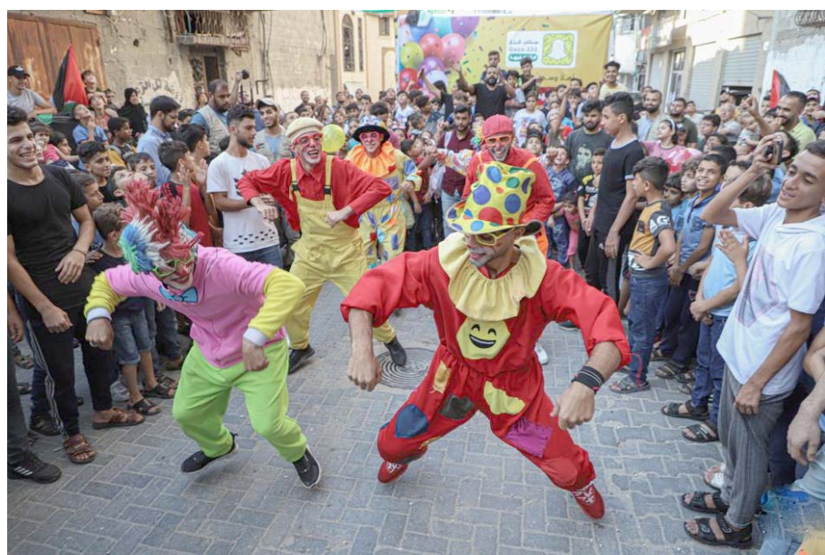
Palestinian young men dressed as clowns perform during an event to entertain children at Jabalia refugee camp in northern Gaza Strip