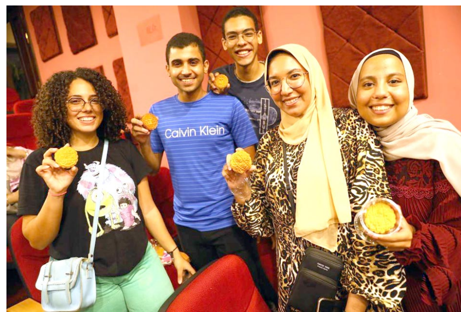
Students take photos with mooncakes at a Mid-Autumn Festival celebration in Cairo, Egypt

"sustainable investing mainstream"; Meghan called Republican senators on their personal cell phones to advocate for paid family leave, and was criticized for introducing herself as the "Duchess of Sussex", and Harry, who had served alongside actual academic experts on an Aspen Institute Commission on Information Disorder, said that he had emailed Twitter's then-CEO Jack Dorsey on 5 January 2021 and "warned" him "that his platform was allowing a coup to be staged". The couple's Archewell website encourages readers to share their own personal stories and warns them to be "mindful of screen time" and not spend too much time online, a reference to their engagement with the Silicon Valley "Time Well Spent" movement led by the Center for Humane Technology.