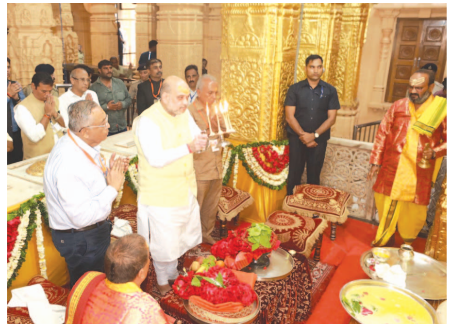
Union Home Minister Shri Amit Shah prayed at the Somnath Mahadev Temple in Gujarat.