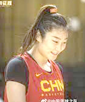
BEIJING, September 11 : The Chinese team said on Friday they will depart for Australia after finishing their final warmup match in Europe on Saturday to

prepare for the FIBA Women's Basketball World Cup. The Chinese team has played seven matches against the national teams of France, Belgium and Serbia, as well as local clubs in Spain over the past month. Centers Han Xu and Li Yueru reunited with the team in Serbia but still need time to better fit into the team as they missed the first five warmup matches in Europe due to their visas. The Chinese team is scheduled to depart for Australia in two groups