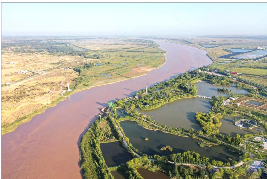
shows the autumn scenery along a section of the Yellow River in Togtoh County, north China's Inner Mongolia Autonomous Region

that the case for remaining inside the bloc lay in the balance. "We had to join the EU just to exist and develop," Kaczyński said. "There was no other way back then." The essence of the EU project had been revealed, he said. "In the EU there is a rule: who is stronger is better. And because Germany is strongest, the old German concept - a concept that can be called neo-imperial - holds sway. The German chancellor, Olaf Scholz, wants to build a superstate of world importance under German leadership." Kaczyński does not hold a government role but is seen as a driving force behind the conservative-national governing party, which has launched a crackdown on judicial independence that has drawn Poland into a row with Brussels. Speaking to a packed room and surrounded by his closest intellectual advisers, Kaczyński continually described the EU as a culturally alien project without specifying in what way. The ferocity of the alienation from the EU project - synonymous with Germany - was on daily display at the economic forum, described as the Davos of central and eastern Europe.