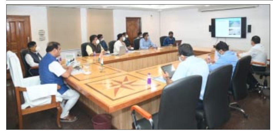
Chief Minister Dr. Himanta Biswa Sarma reviewing the functioning of the Water Resources