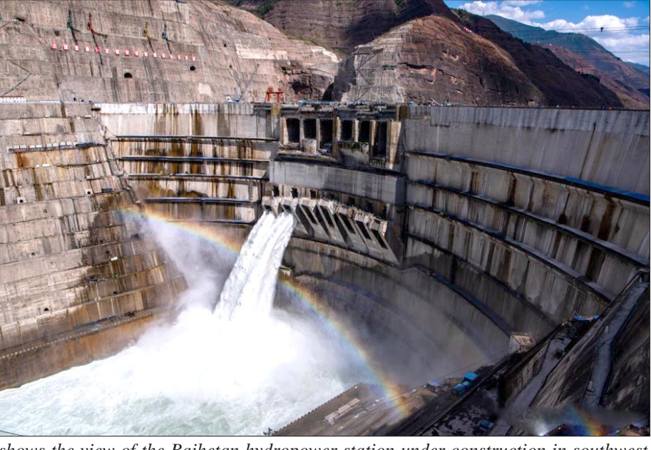
shows the view of the Baihetan hydropower station under construction in southwest China. Baihetan on the Jinsha River, the upper section of the Yangtze

Goliath battle ensued. Lhoist is the world's largest lime, mineral and dolomite producer, with 100 branches in more than 25 countries and 6,400 employees, generating a turnover of more than €bn.In contrast, life in the Trappist abbey which boasts a brewing halls described as the most beautiful in Belgium, akin to a "beer cathedral" - is characterised by prayer, reading and manual labour. The earliest mention of a brewery at the monastery was in 1595, but the current site dates to 1899. The water for the beer is drawn from a well inside the monastery walls. The renowned quality of the monks' beer has, however, earned