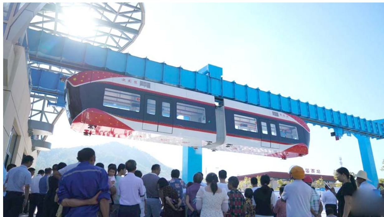
A train on the maglev line Rainbow stops at a station in Xingguo County, east China's Jiangxi Province

her visit, saying it was "absolutely" worth it. "We cannot allow the Chinese government to isolate Taiwan," Pelosi said in an interview with NBC. "They're not going to say who can go to Taiwan." The Chinese Communist party government (CCP) claims Taiwan as a breakaway province of China. In a white paper released through state media on Wednesday morning, it reiterated its resolve to annex Taiwan by force if peaceful means were unsuccessful in Taiwan" after "unification".