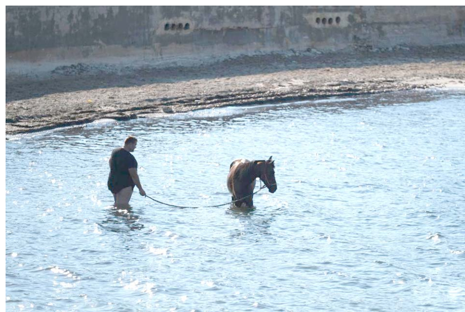
A horse cools off on the Bahar ic-Caghaq beach, Malta