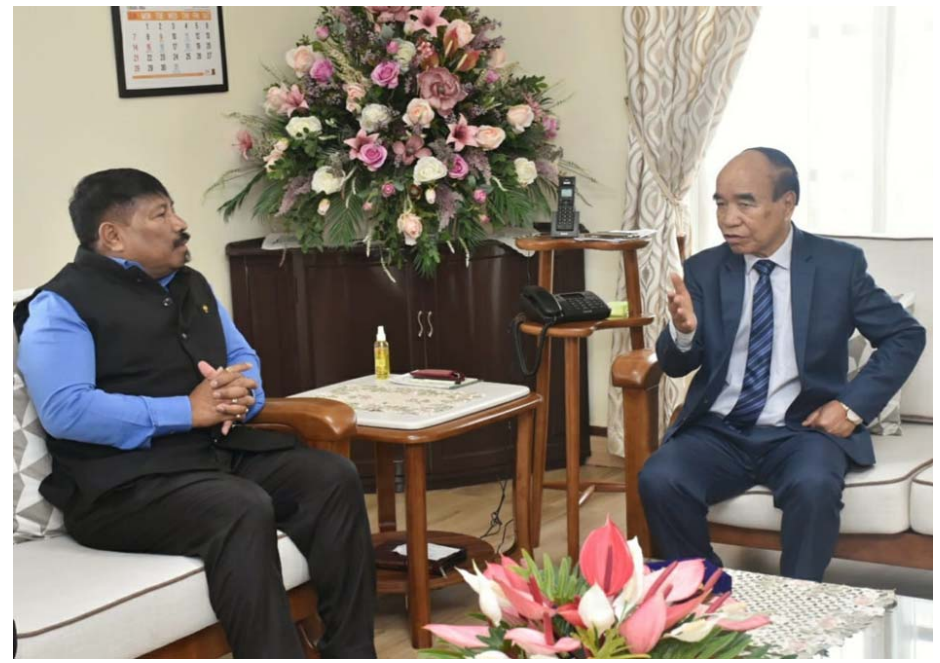
Cabinet minister Atul Bora met with Mizoram CM Zoramthanga on August 10 in Aizawl.