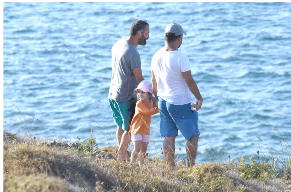
People enjoy a weekend tour near the Bosphorus Strait in Istanbul, Türkiye