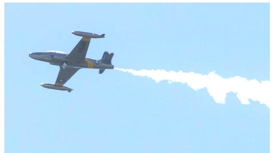
An Acemaker T-33 makes an aerial demonstration during the 2022 Abbotsford International Airshow in Abbotsford, Canada

Baramati, where the party had polled a good number of votes in the previous elections. Fadnavis said Sitharaman is likely to tour Baramati in September and travel programmes of other central BJP leaders and Union ministers tasked with responsibilities for Lok Sabha polls will be finalised soon. "In these 16 constituencies, the central BJP will concentrate its energies to better the party's performance," Fadnavis said. Baramati is currently represented by Supriya Sule, the daughter of NCP chief Sharad Pawar. The seat is considered a bastion of the Pawar family.