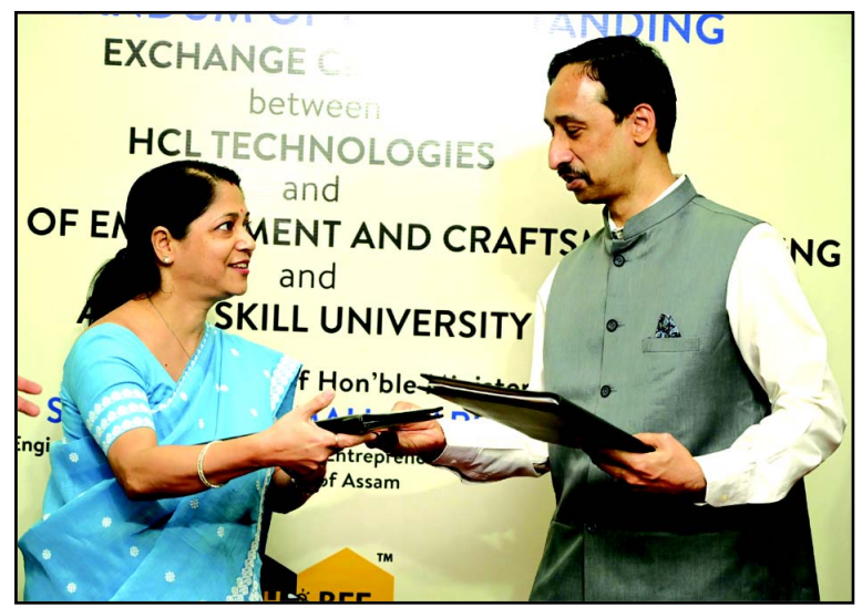
Guwahati- Four key MoU's with Walmart, Flipkart and HCL signed