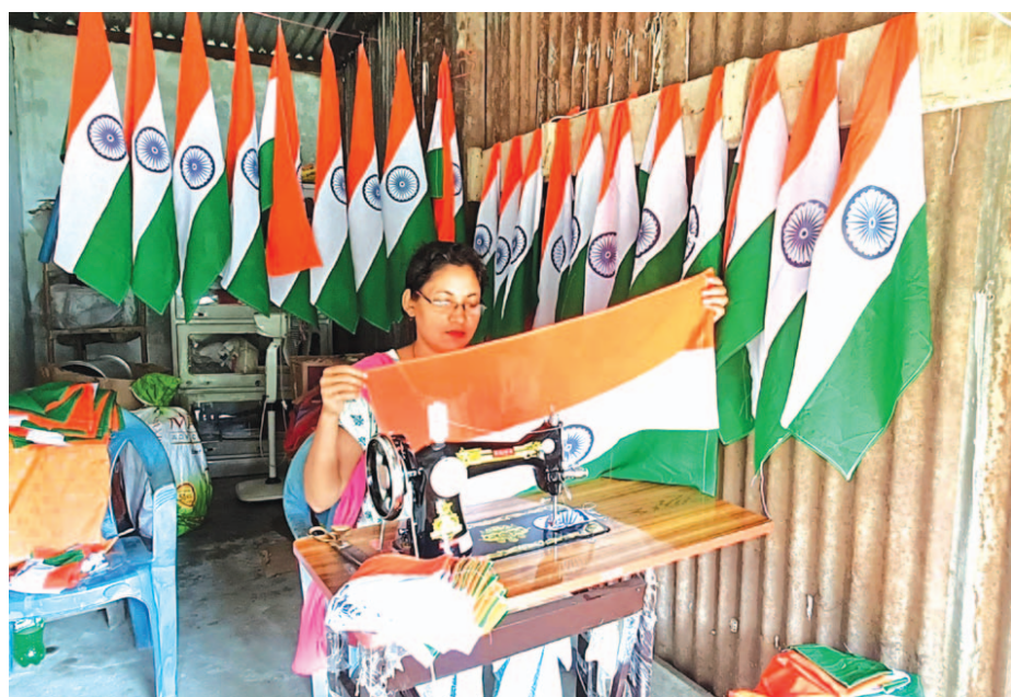
Dhakuakhana- A women making National Flag On Thursday