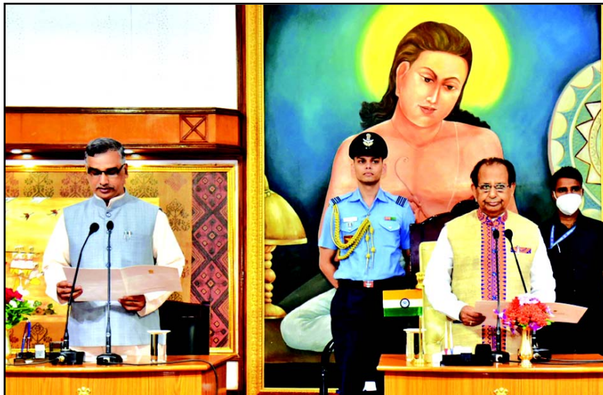
Guwahati- Governor administrative oath Vice Chancellor

New Delhi, August 04 : Chief Justice of India N V Ramana on Thursday set in motion the process of appointment of his successor by recommending the name of Justice Uday Umesh Lalit, the most senior judge, to the Centre. The CJI personally handed over the copy of his letter of recommendation to Justice Lalit. Justice Ramana, the 48th chief justice of India who took over as head of the Indian judiciary from S A Bobde on April 24, 2021, is scheduled to demit office on August 26 after a tenure of over 16 months. Justice Lalit, who would be appointed head of the judiciary on August 27, will have a tenure of less than three months as the chief justice of India. He retires on November 8 this year. Justice Ramana, who is set to demit office on August 26 on superannuation, had received a communication from the Minister of Law and Justice to nominate his successor on Wednesday. On Wednesday, a communication from the apex court said, "Today (03.08.2022) at 2130 hrs, the Secretariat of the Chief Justice of India has received a communication dated 03.08.2022 from the Minister of Law and Justice requesting the CJI to recommend the name of his successor." According to the Memorandum of Procedure, the Law Minister seeks a recommendation from the outgoing CJI to nominate his successor. Usually, the recommendation is sought within a month of the retirement of the incumbent Chief Justice of India.