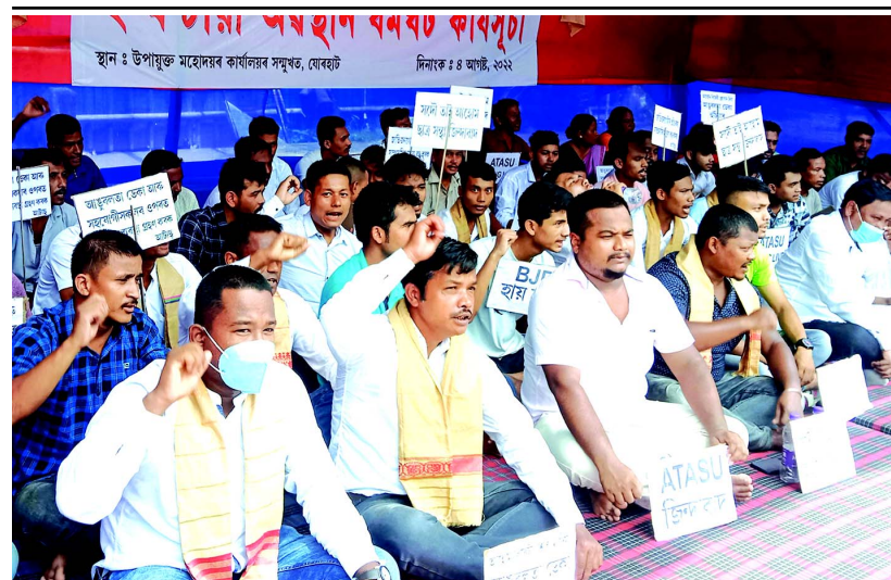
Jorhat- All Tai Ahom Students union Protest