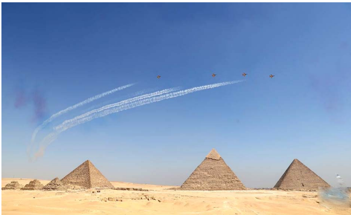
Aircrafts perform aerobatics during the Pyramids Air Show 2022 at the Giza Pyramids scenic spot in Giza, Egypt