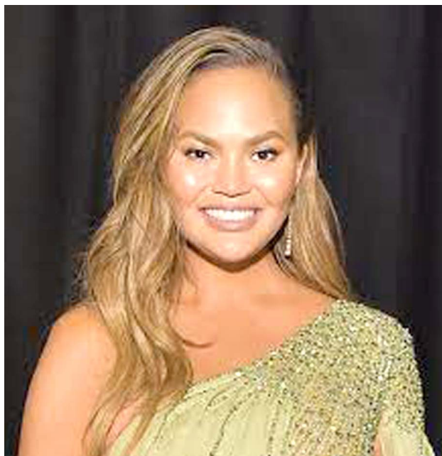
Washington, August 04: Chrissy Teigen and her

husband John Legend are expecting another child nearly two years after the couple suffered a pregnancy loss. Teigen made the announcement Wednesday on Instagram, where she posted two photos of her baby bump. She wrote that joy has "filled our home and hearts again" after a miscarriage in 2020, which she documented in intimate detail in its aftermath. "We have another on the way," wrote the 36-year-old model and cookbook author, who shares two children - Luna and Miles - with Legend. In the post, she wrote about her