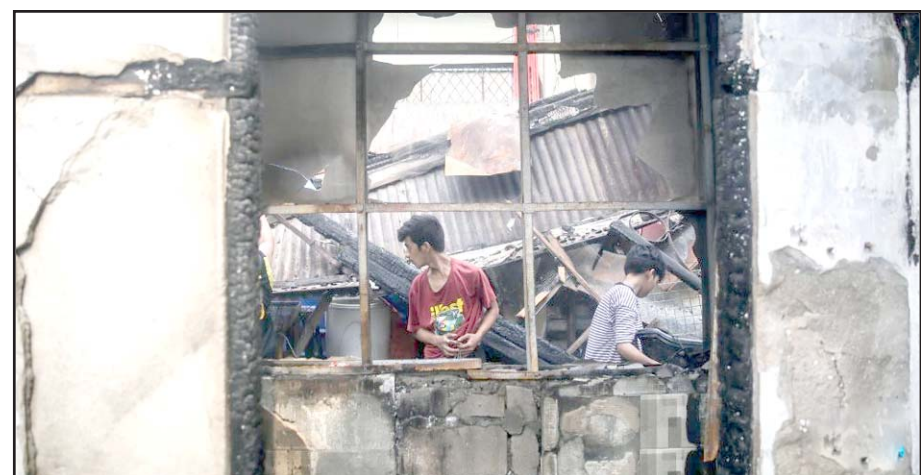
Residents search for reusable materials from their charred homes after a fire at a residential area in Manila, the Philippines

interpretation's preoccupation with the penis could be considered inappropriate for a grand public display.