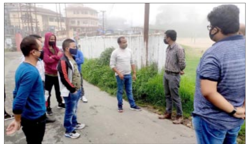
Meghalaya- Jaintia Student's Union block the entry

13th June, 2021. In return direction, services of Train No. 07029 Guwahati - Secunderabad weekly summer special leaving from Guwahati on Wednesday have been extended to run for two trips. The train will leave from Guwahati on 9th and 16th June, 2021. Services of Train No. 09501 Okha - Guwahati special leaving from Okha on Friday have been extended to run for another trip on 11th June, 2021. In return direction, services of Train No. 09502 Guwahati - Okha special leaving from Guwahati on Monday have been extended to run for another trip on 14th June, 2021. The train will run with revised timings at Kota junction, Sawai Madhopur and Bayana junction. Restoration of train service: Services of Train No. 03246 Rajendra Nagar - New Jalpaiguri (tri-weekly) special leaving from Rajendra Nagar on Thursday, Friday and Saturday have been restored