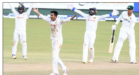
Colombo, June 08 : The Sri Lankan

cricketers have agreed to compete against England on a tour-specific contract but would not sign the annual contracts unless governing body SLC explains the evaluation process. Sri Lanka are scheduled to tour England for three Twenty20s and as many ODIs between June 18 and July 4. Following a stormy round of talks, the players were told by the management that they would either call off the England tour or