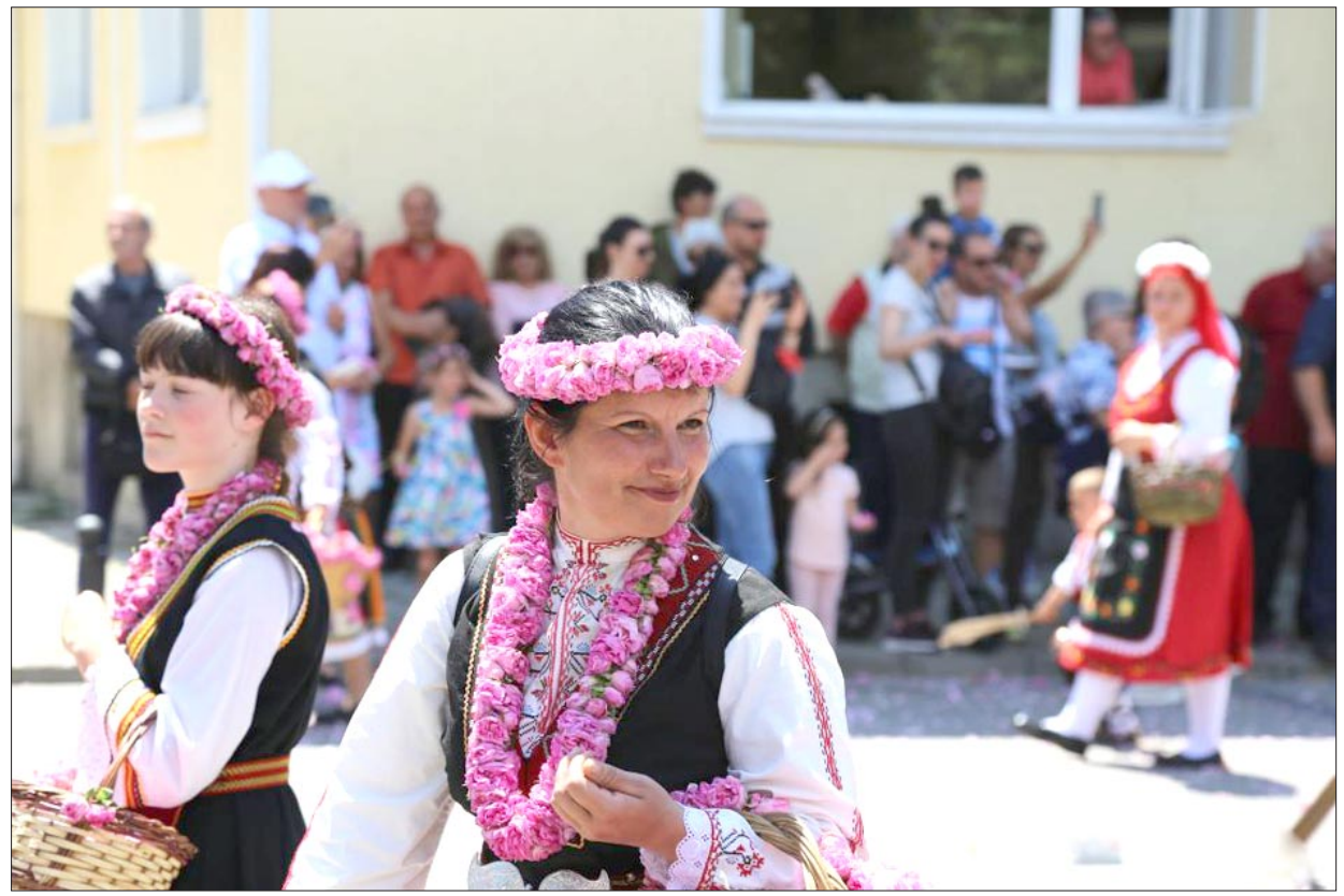
People participate in the Rose Festival parade in Kazanlak, Bulgaria.