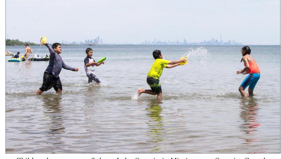
Children have a water fight at Lake Ontario in Mississauga, Ontario, Canada,