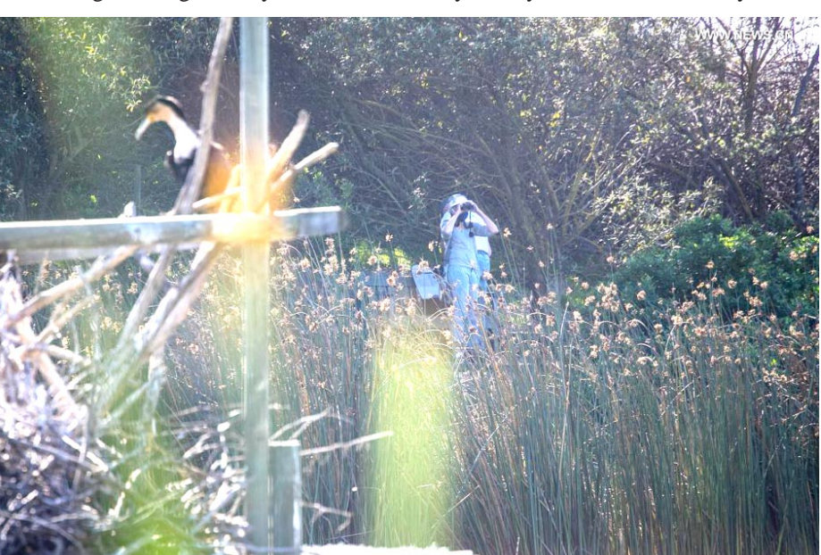
Visitors enjoy the view in the Intaka Island nature reserve in Cape Town, South Africa