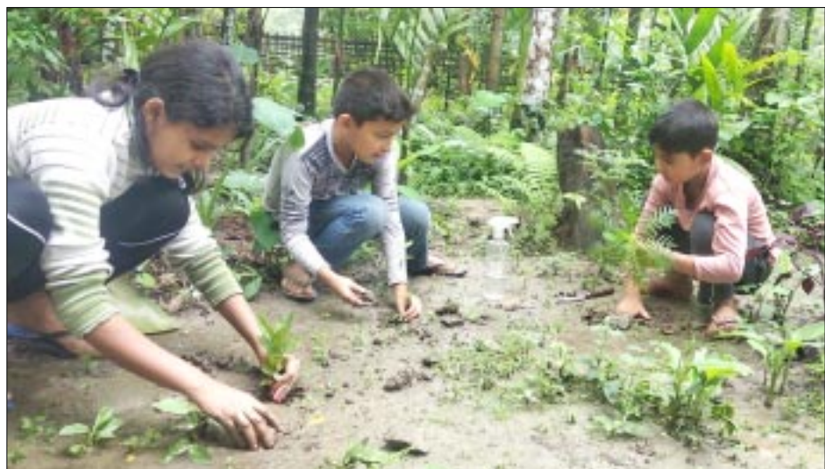
Three child saplings planted in Dhakuakhana on the occasion of World Environment Day