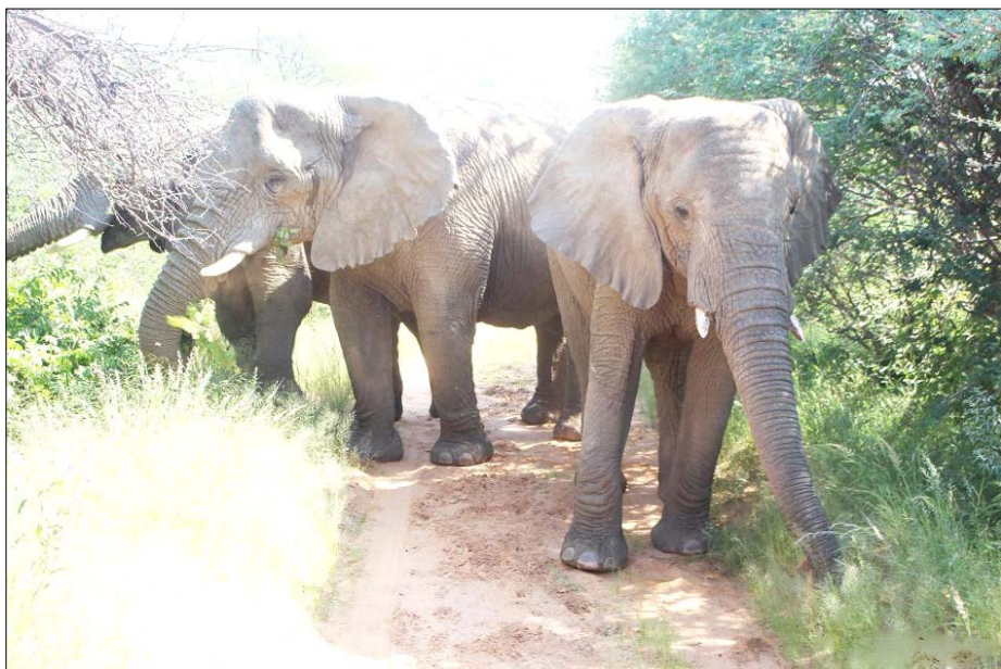
Photo taken on April 5, 2021 shows elephants in Omaruru, Namibia

six months to make the final call. The board said that Facebook's "indeterminate and standardless penalty of indefinite suspension" for Trump was "not appropriate", criticism that Clegg wrote the company "absolutely accept[s]". The new policy allows for escalating penalties of suspensions for one month, six months, one year, and two years. The former president has been suspended since January, following the deadly Capitol attack that saw a mob of Trump supporters storm Congress in an attempt to overturn the 2020 presidential election. The company suspended Trump's Facebook and Instagram accounts over posts in which he appeared to praise the actions of the rioters, saying that his actions posed too great a risk to remain on the platform. Following the Capitol riot, Trump was suspended from several major tech platforms, including Twitter, YouTube and Snapchat. Twitter has since made its ban permanent. The former president called Facebook's decision "an insult to the record-setting 75m people, plus many others, who voted for us in the 2020 Rigged Presidential Election," in a statement. "They shouldn't be allowed to get away with this censoring and silencing, and ultimately, we will win." Trump received fewer than 75m votes in the 2020 election, which he lost.