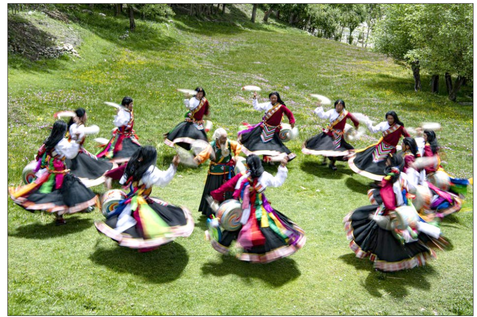
Dancers perform Jiuhe Zhuo Dance, a national intangible cultural heritage, in Jiuhe Village of Qonggyai County in Shannan