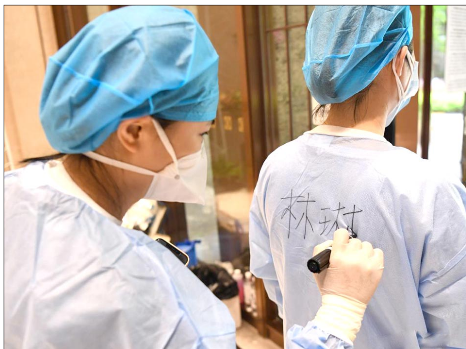
A volunteer in charge of delivering necessities for residents under home quarantine helps another volunteer write her name on the protective suit at a residential area at Liwan District of Guangzhou